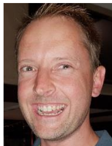
MC du toit