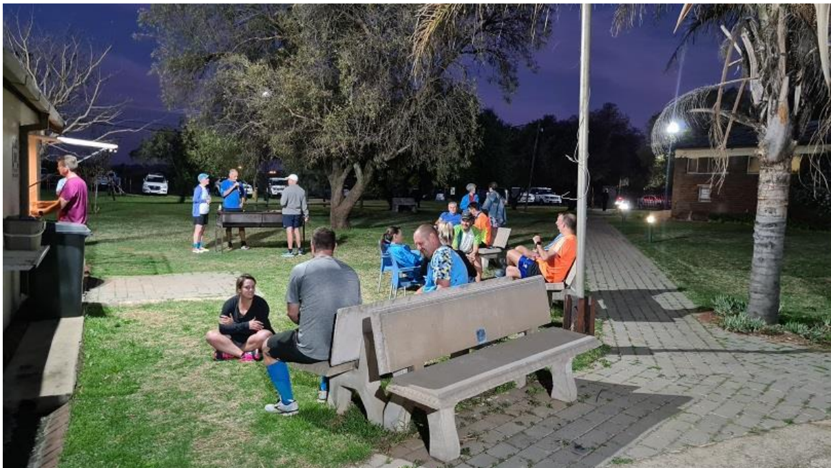
A perfect evening at the club house last Tuesday. We hope to see more people at the club house now after the latest announcement by the President