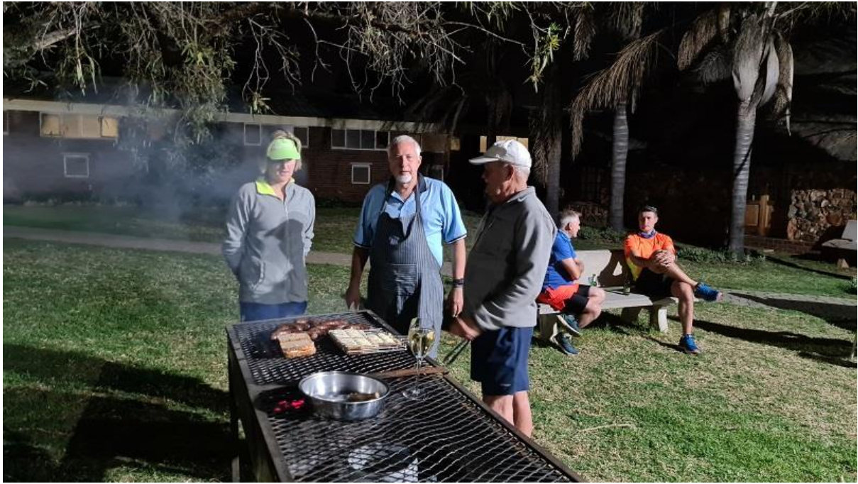
Some of the regular braaiers in action