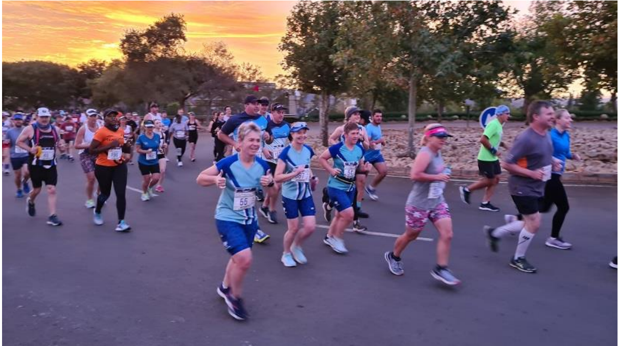
A beautiful morning at the Irene Village Mall with a normal race taking place