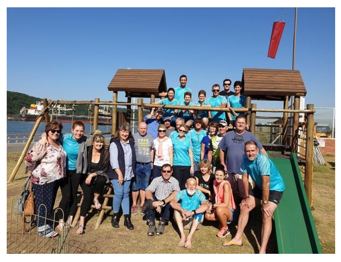
Some of the runners and supporters at the post function at the Durban Ski Boat Club