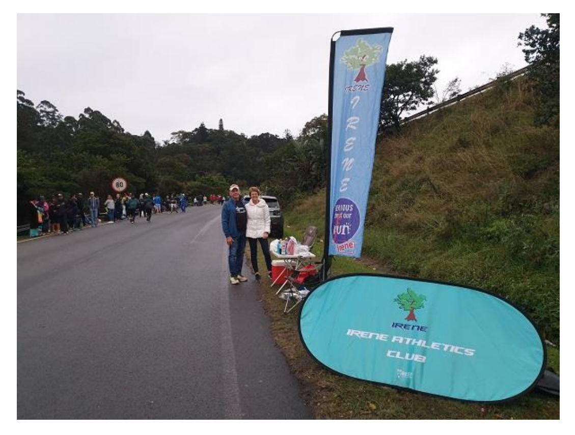
The support station at the bottom of Fields Hill