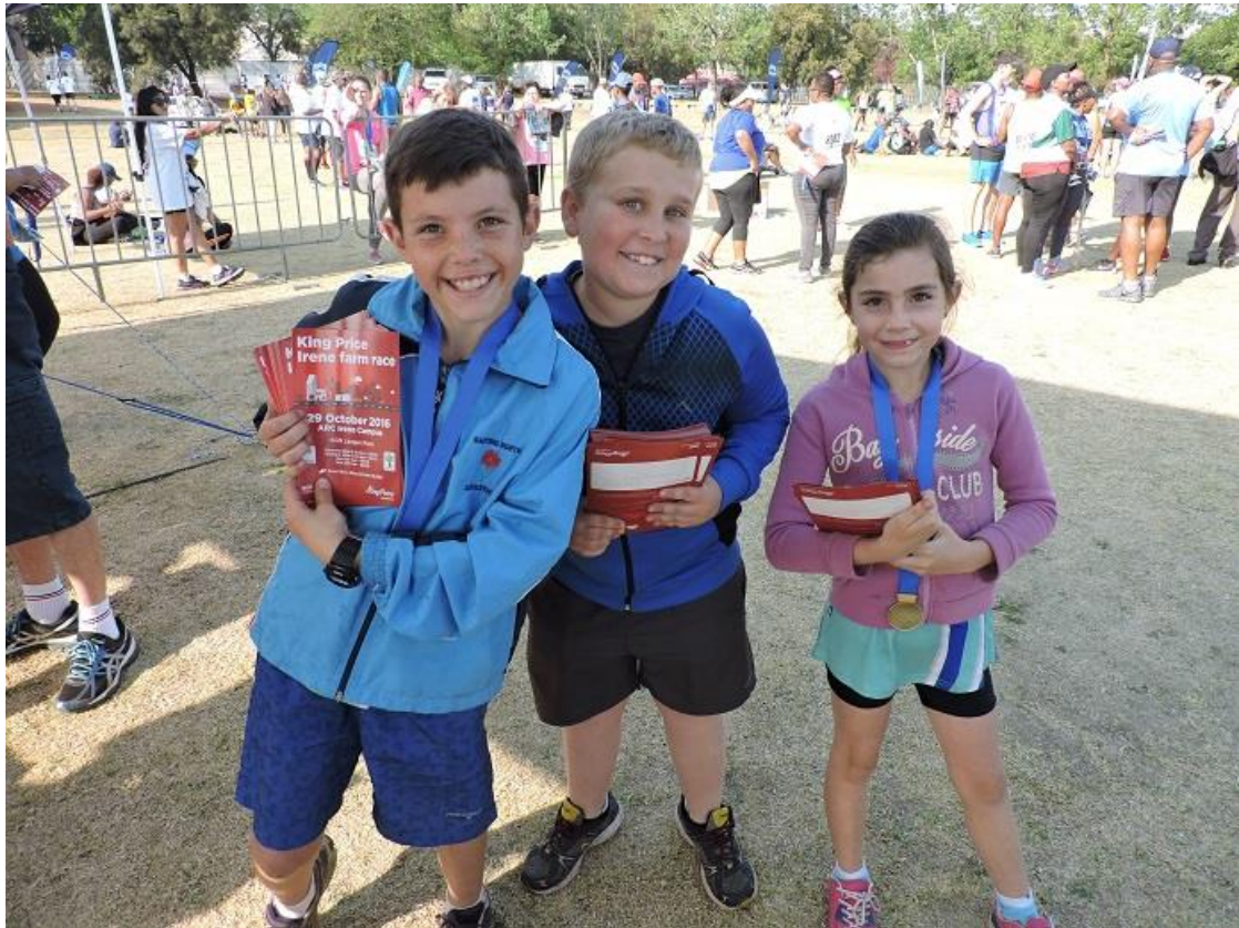
Three stars who handed out flyers