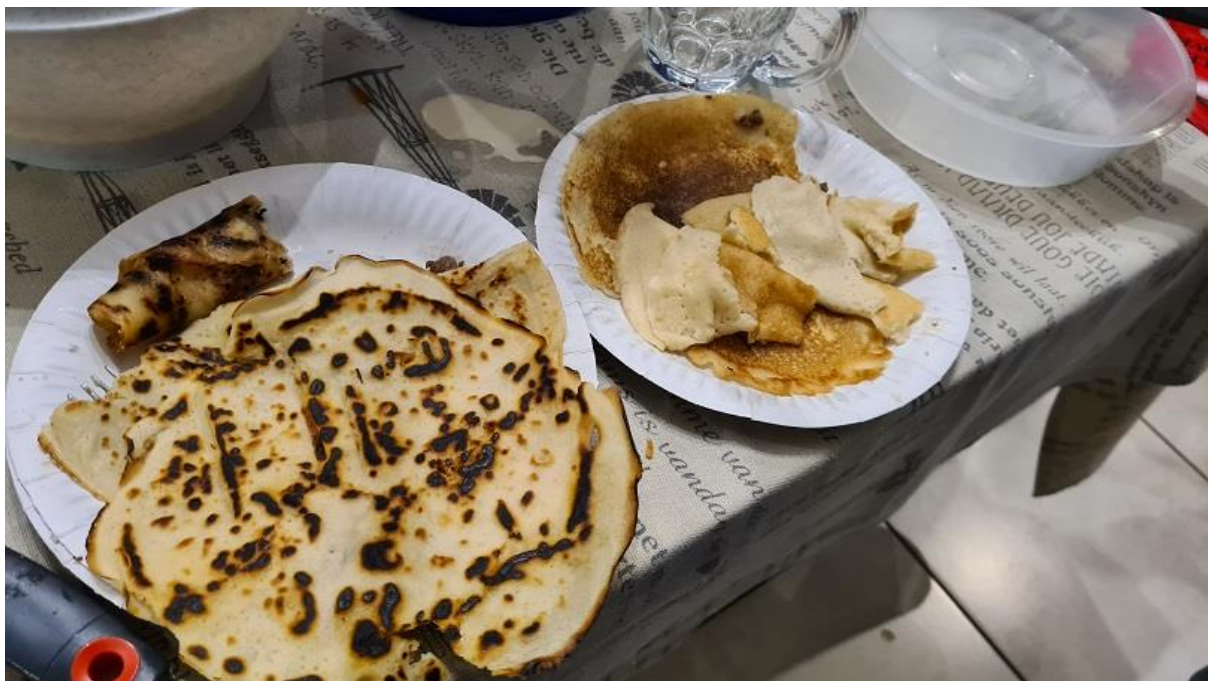
Although all three teams knew what they were doing, there were a few flops as well