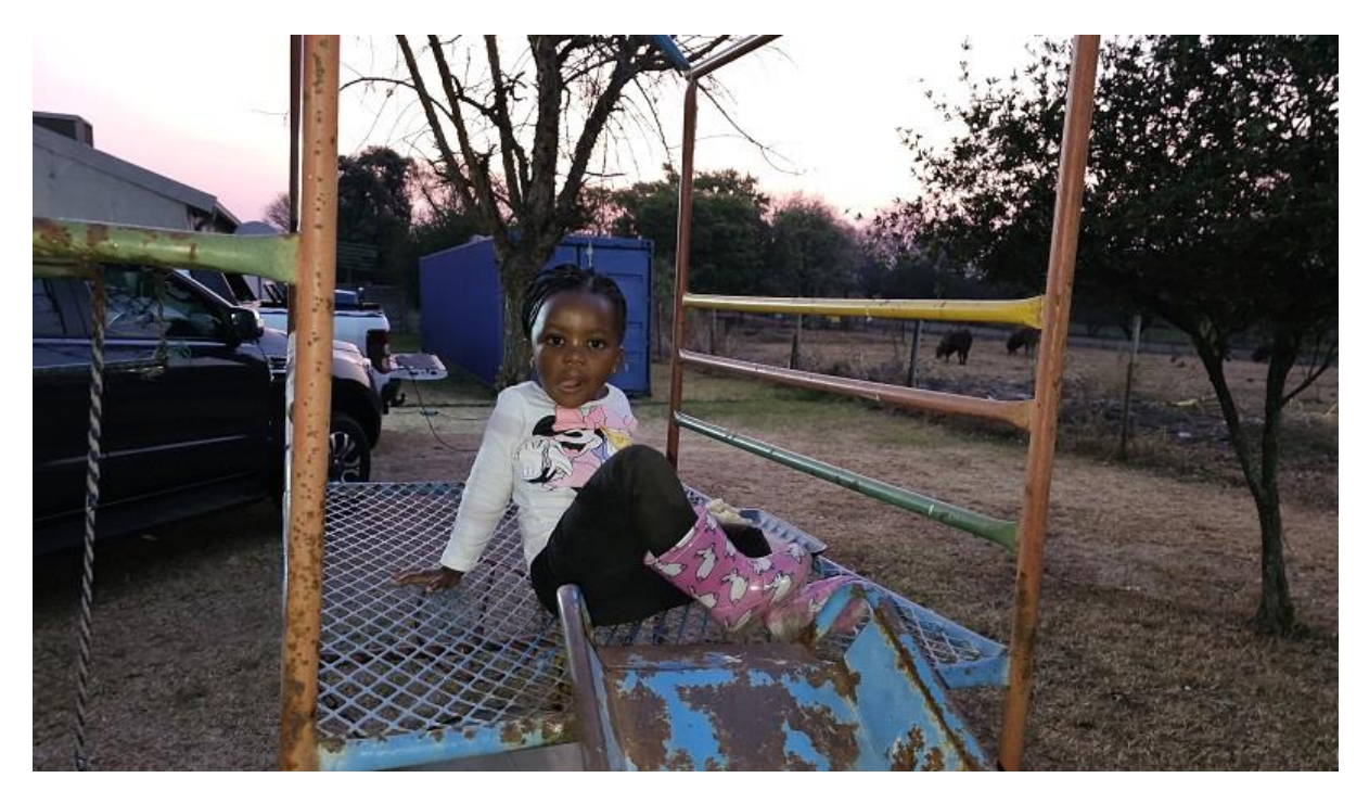
Playtime at the time trials