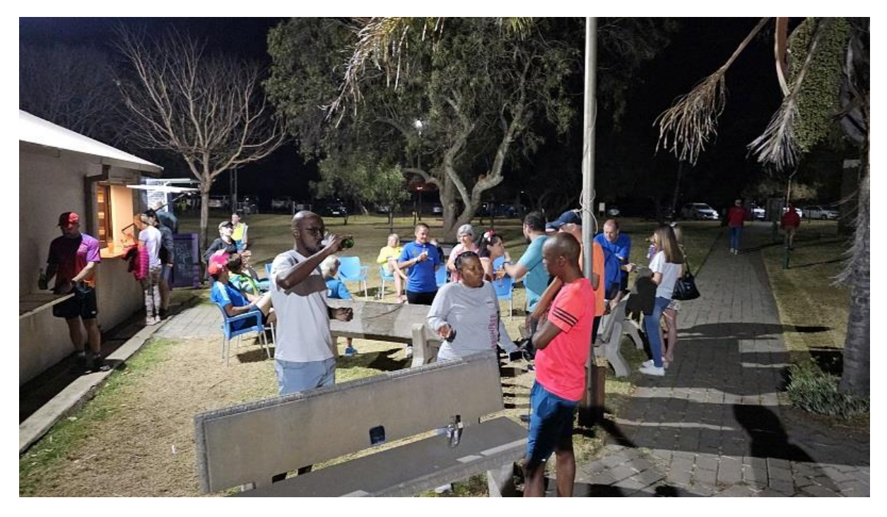
Another successful social evening at the club