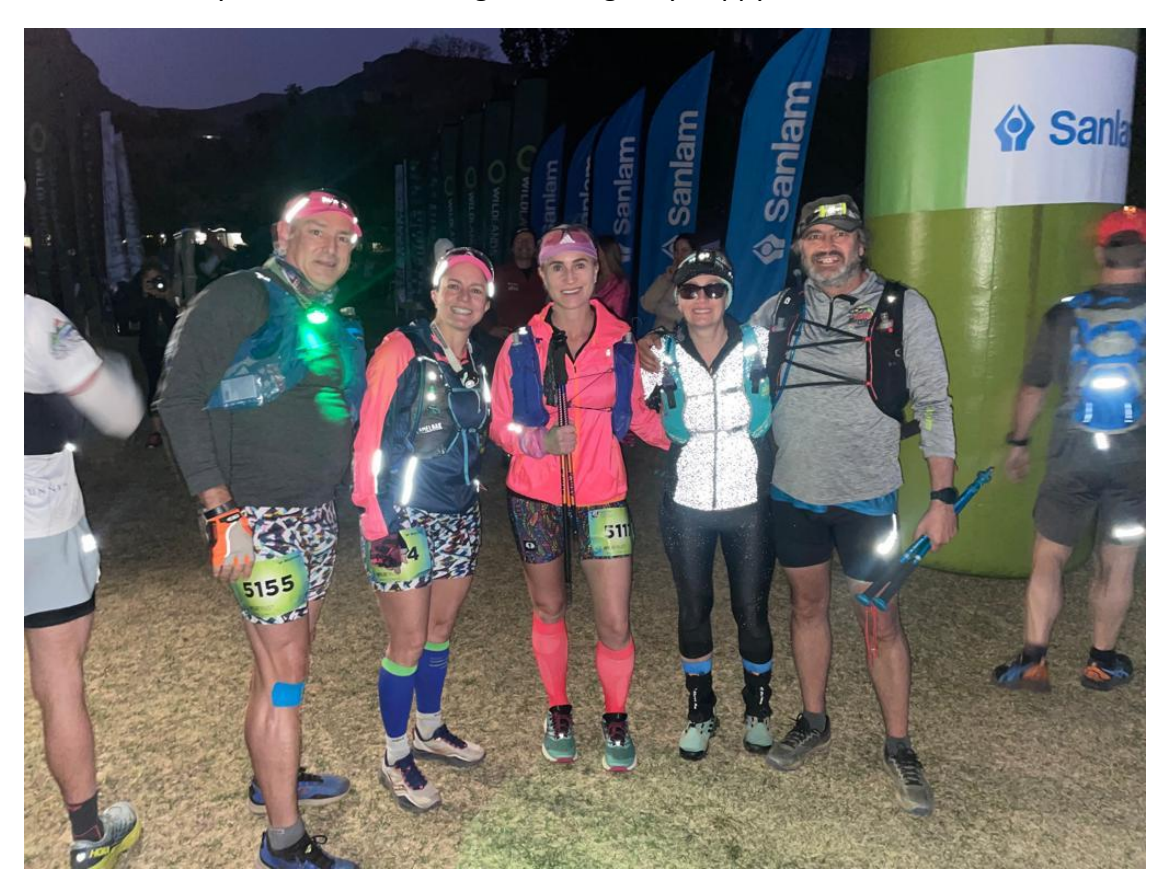
Irene members at the Mont-Aux-Sources race