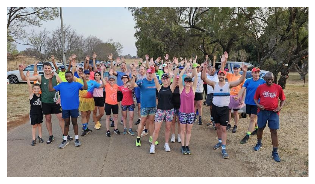
Time trial runners on Tuesday last week