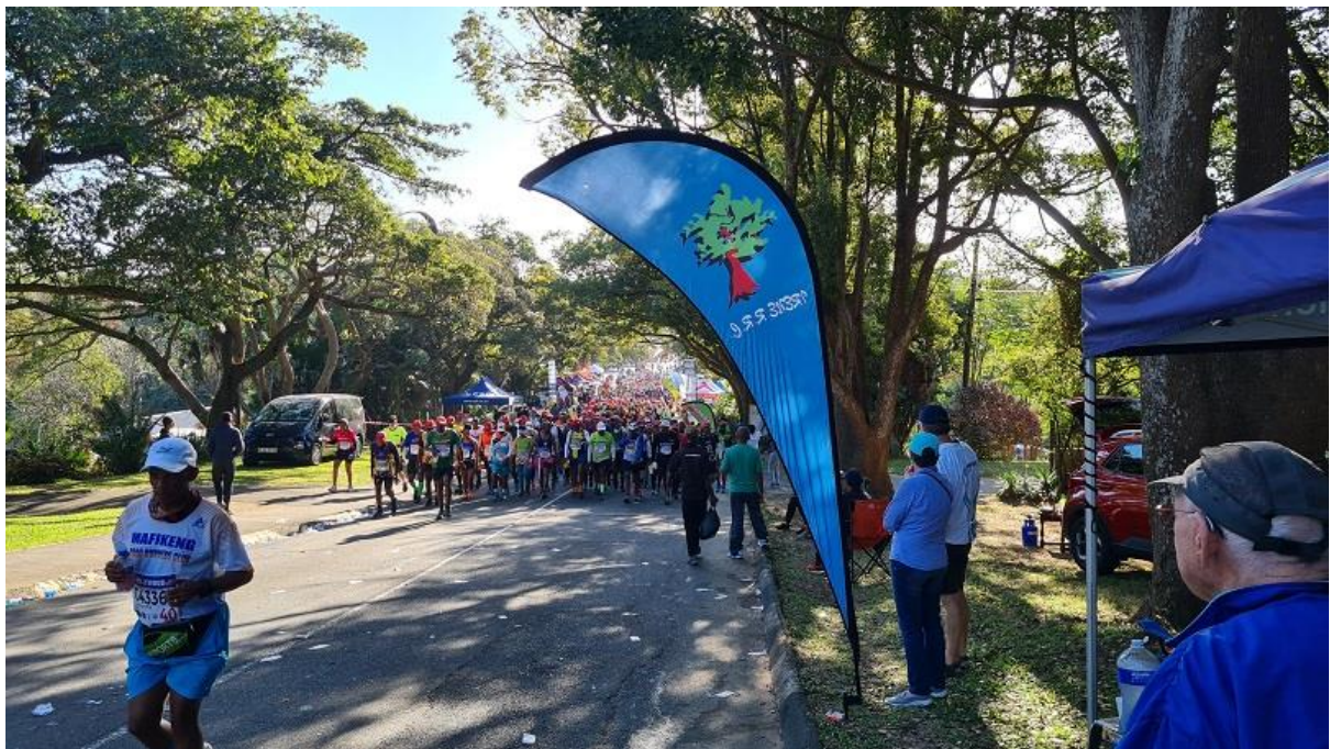
Masses of runners approaching the Irene support station