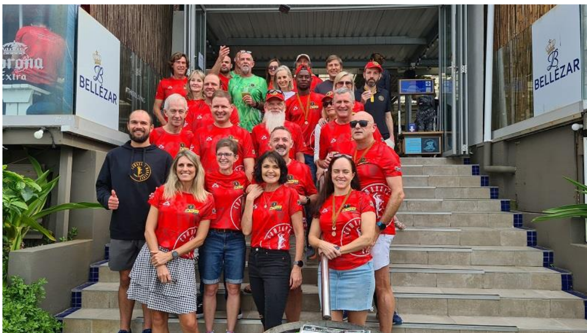
Irene members at the function on Monday