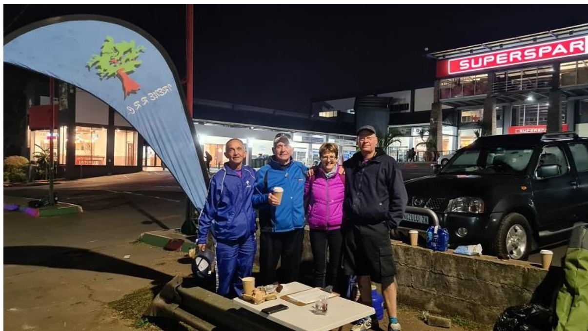
Getting the support station ready in Camperdown