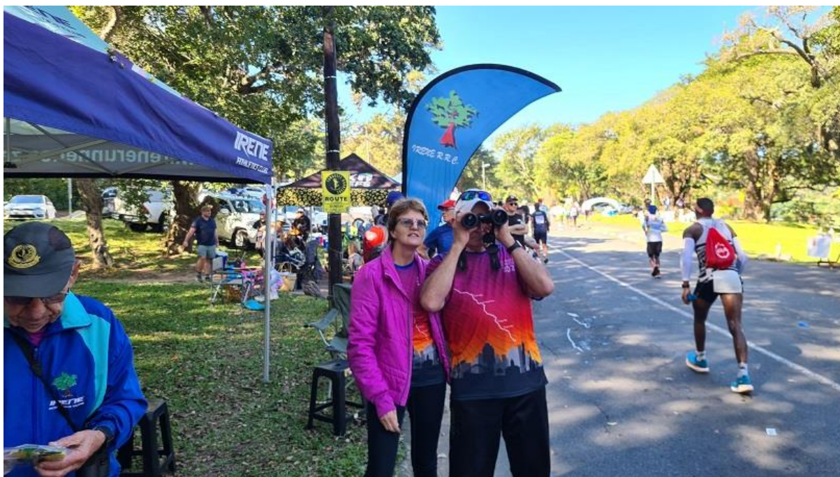
Making sure that no Irene runner is missed at the support station at Cowies Hill