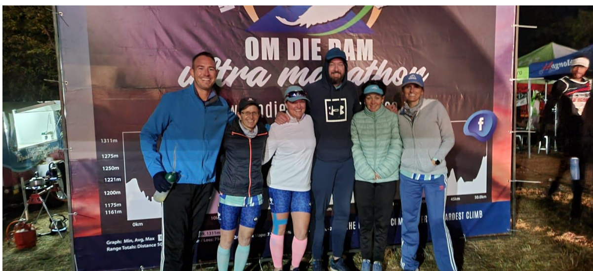
Early morning at the Om die Dam race on Saturday