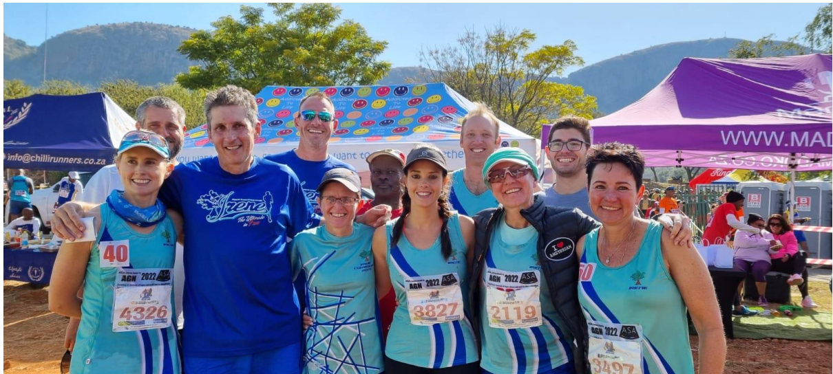
A few of the Irene members who did the Om die Dam