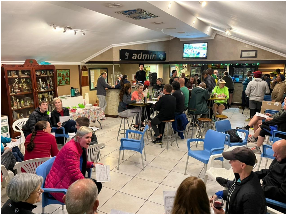
Everybody enjoying themselves