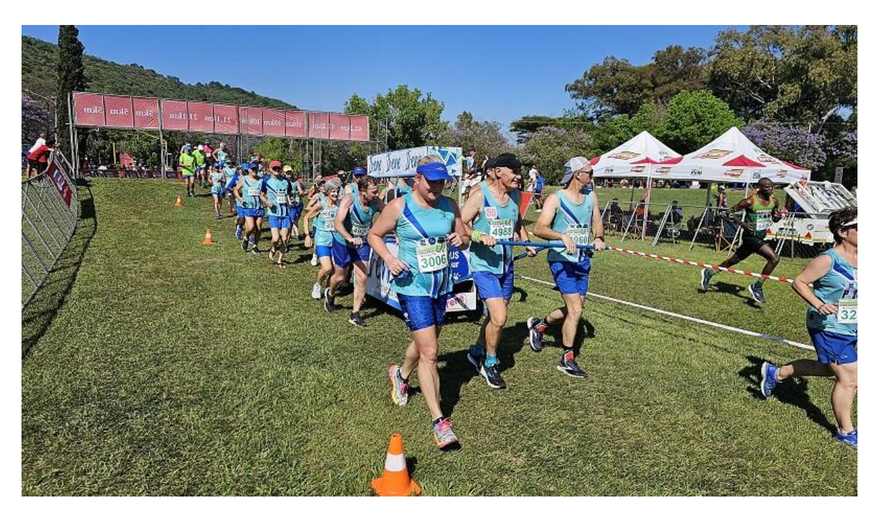
Entering the finish area