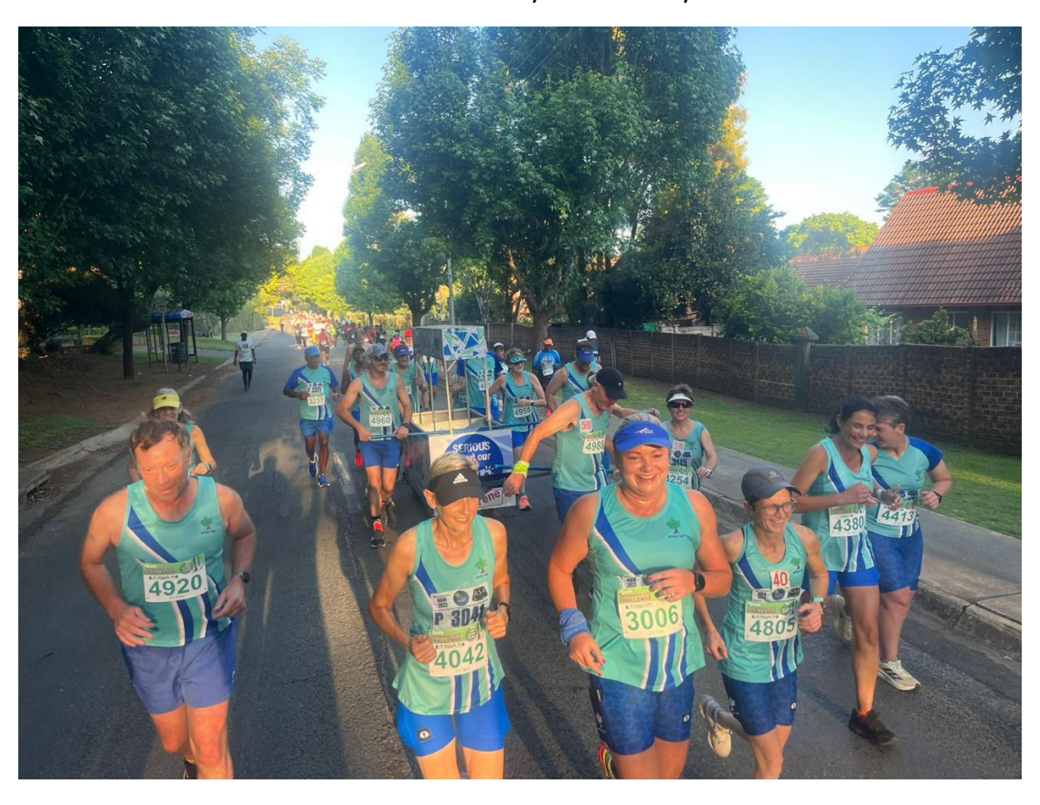
Everybody enjoying themselves