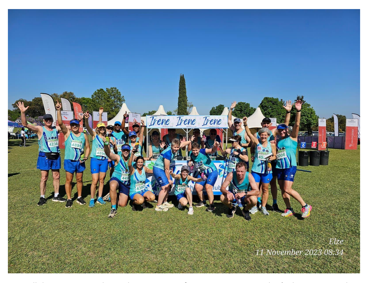
Well done to 25 members who were part of a great experience. That's the Irene spirit!