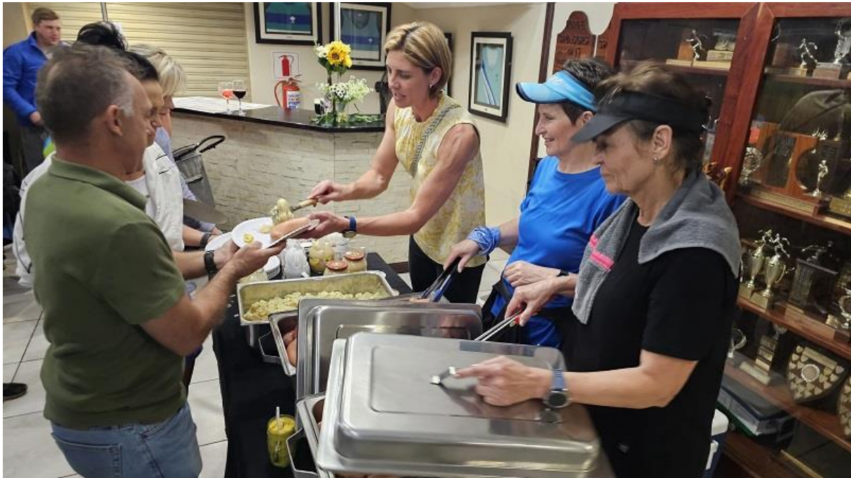
The food was excellent