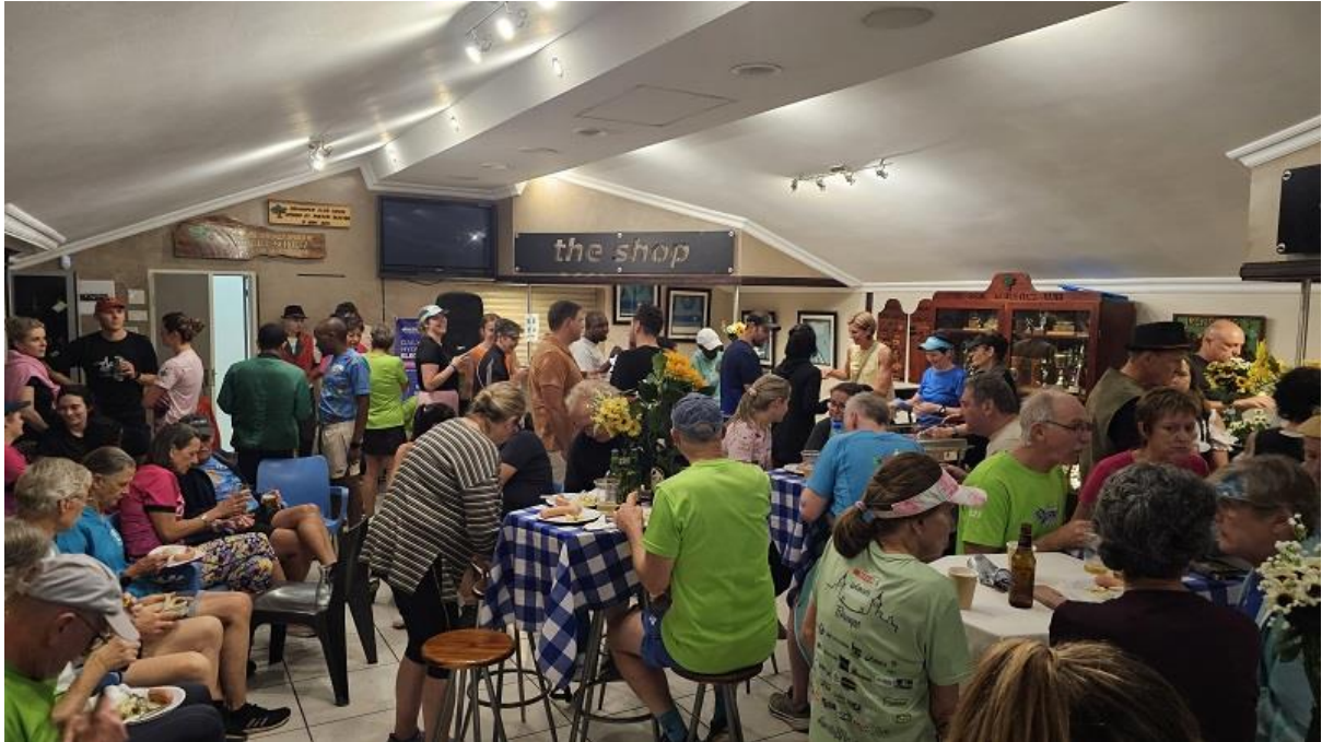
A beautiful sight to see so many members in the club house