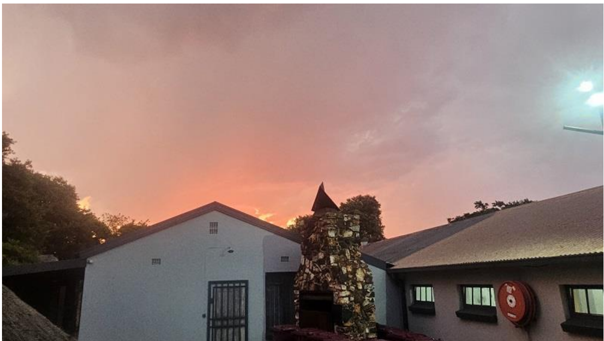
Nature also played its part