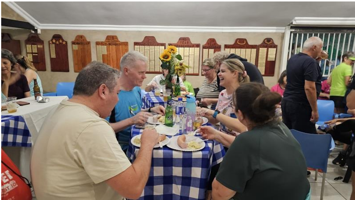
Happy members enjoying a lovely meal