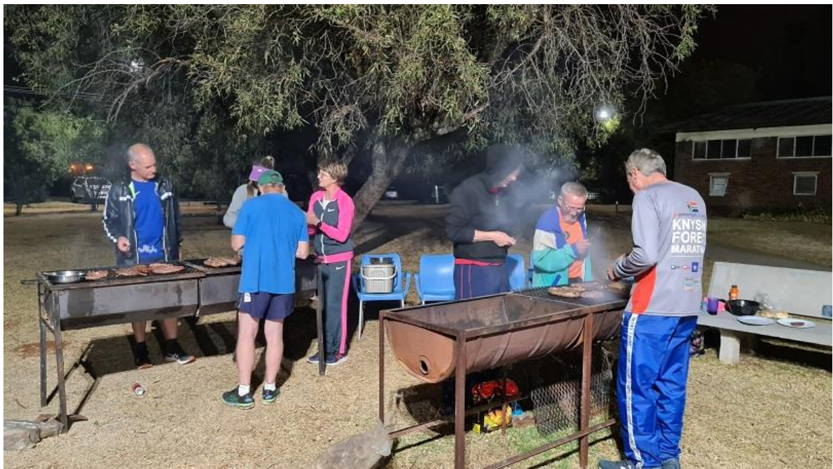
The braai in full swing