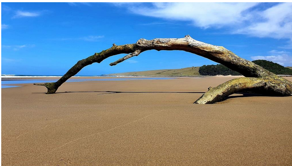
What a privilege to run on a route that looks like this