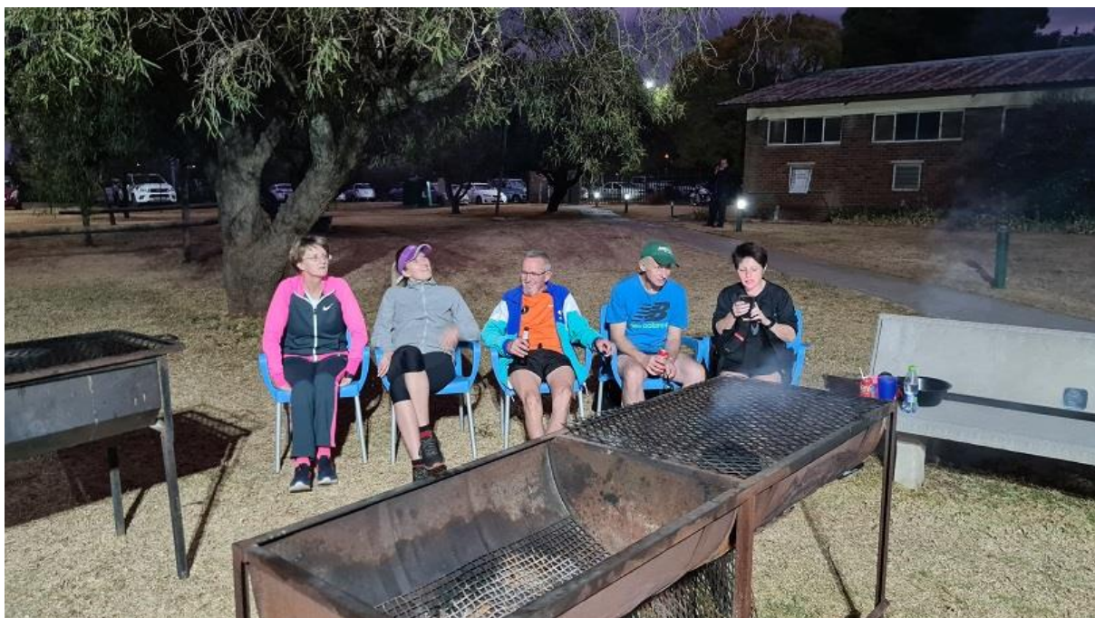
Waiting for the braai to begin