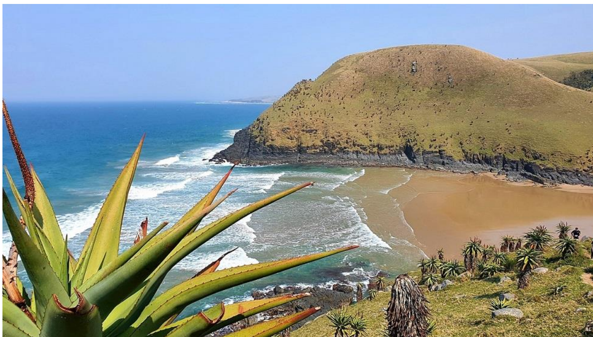
Beautiful scenery on the route