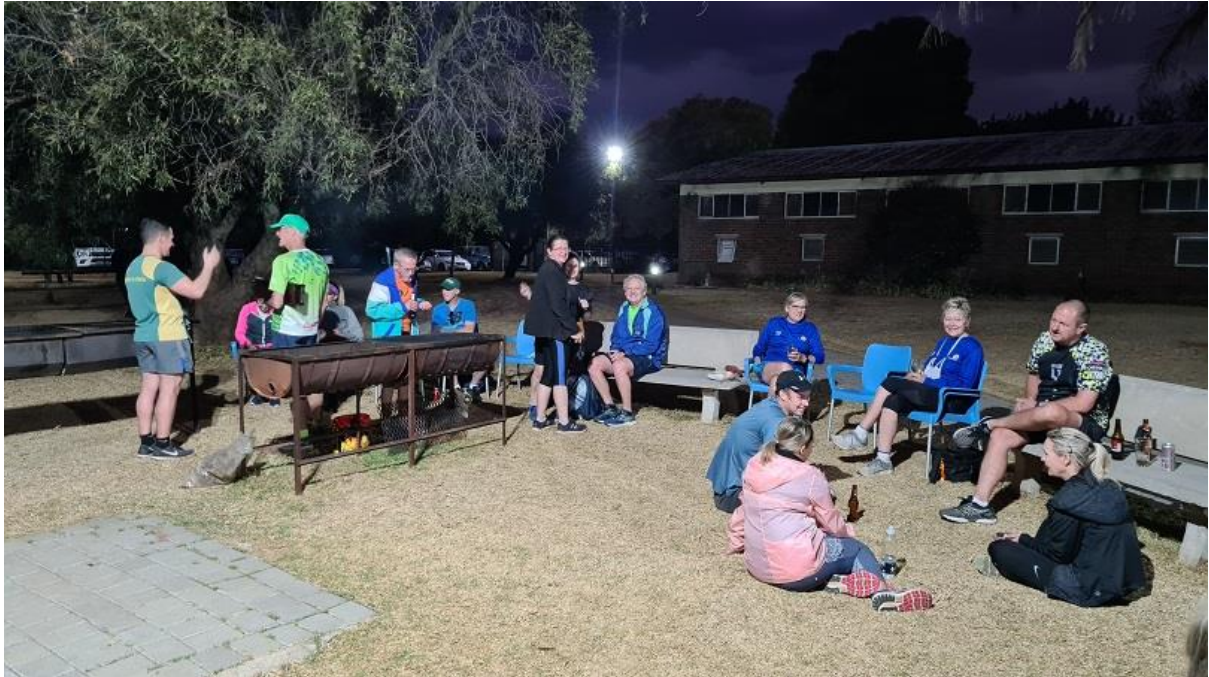
The place to be