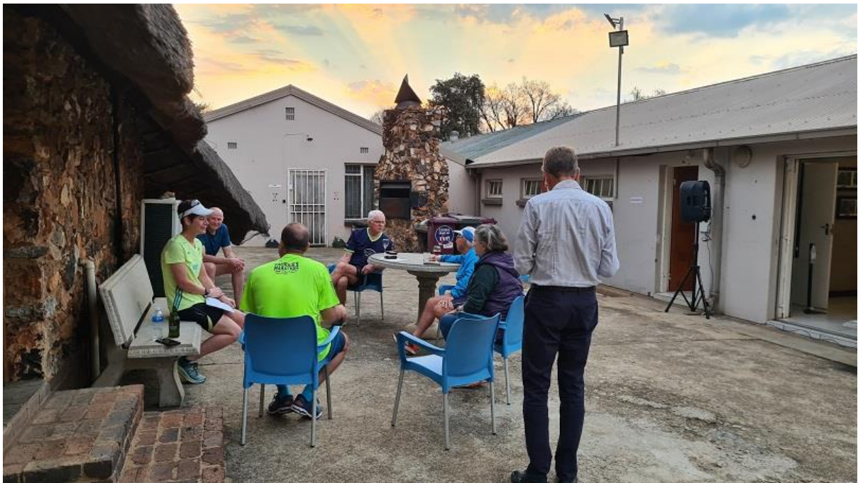
Old friends catching up