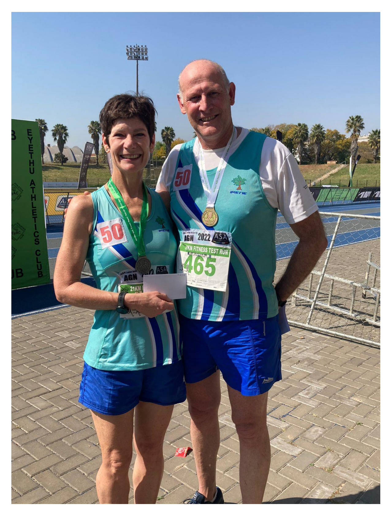
The proud Visser podium couple