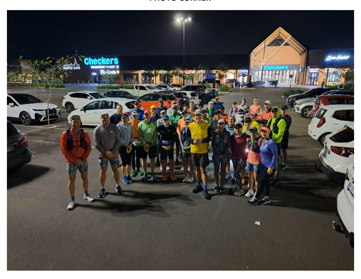
The participants at the Charity run on Saturday