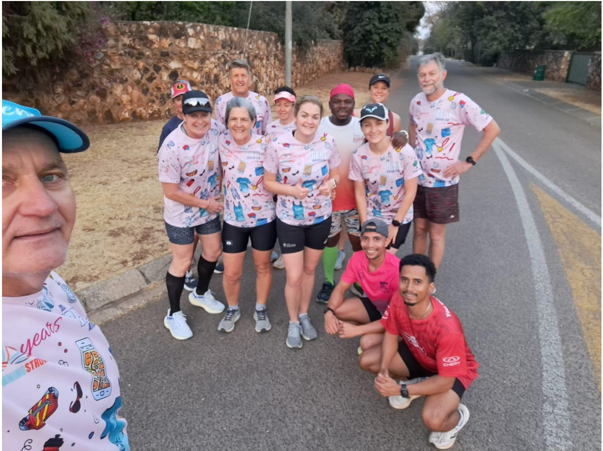
Part of the Sunday morning group