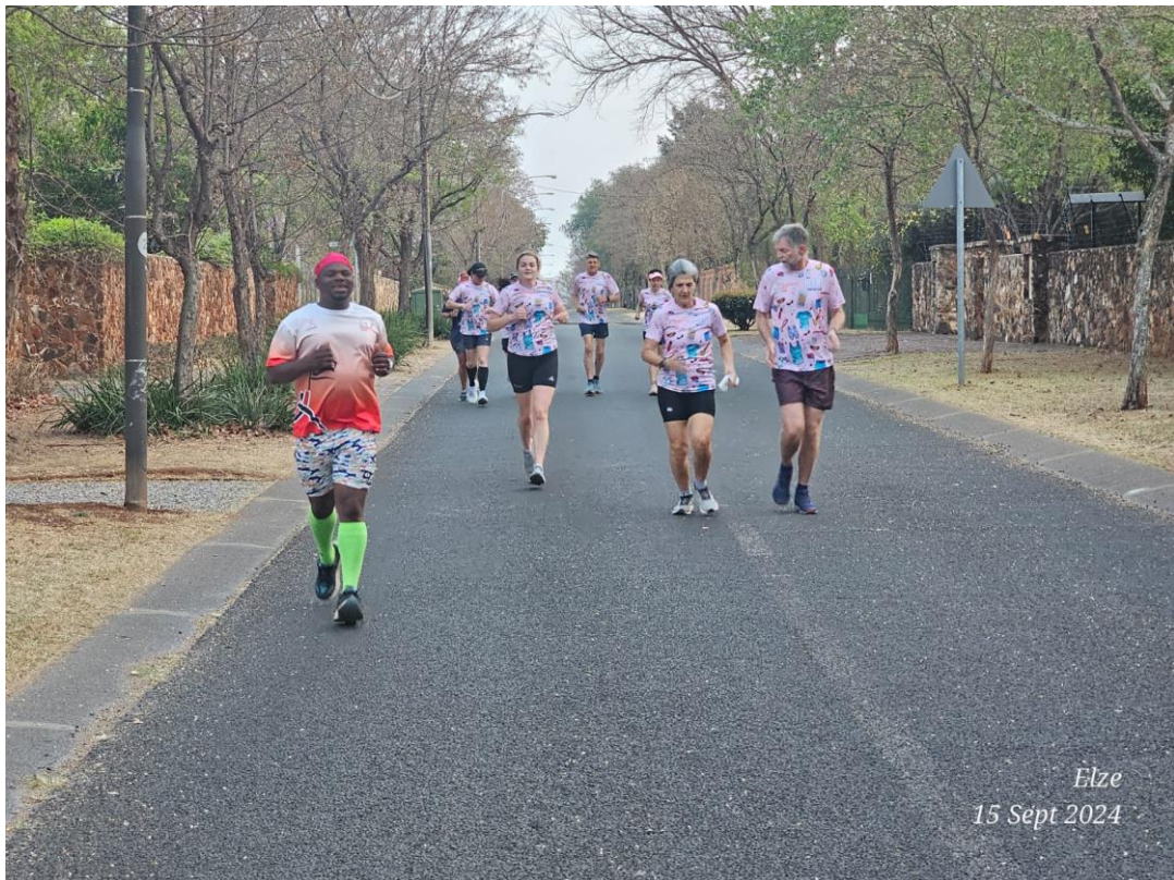
Sunday morning running