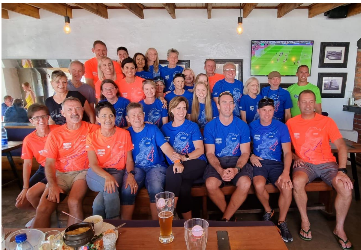
Sunday lunch in Cape Town to celebrate the Two Oceans