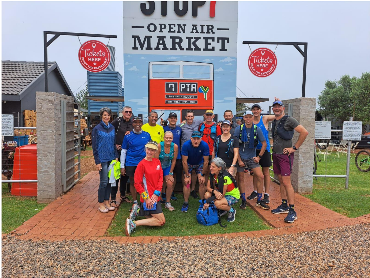
The Sunday morning training group that finished at Bus Stop 7