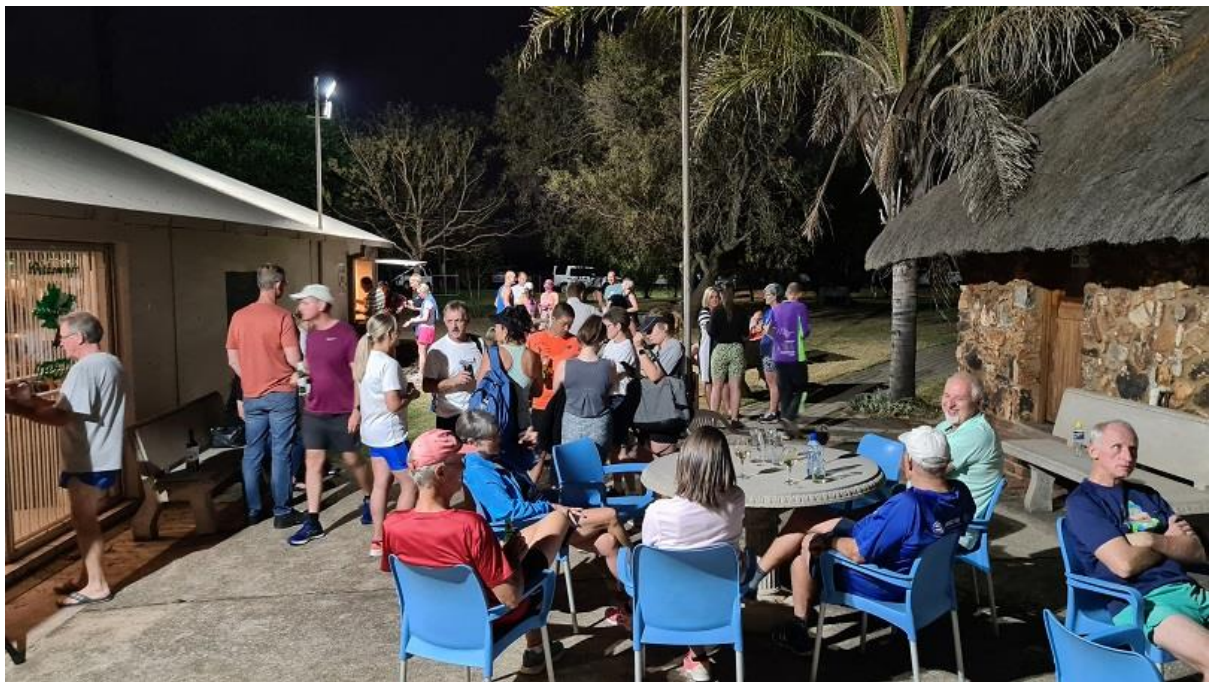
As always, the social evening was a huge success