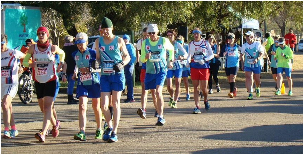
The start of the 1 st Irene Open Walking Grand Prix