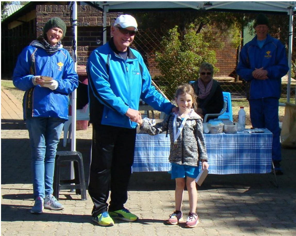
The youngest competitor at prizegiving