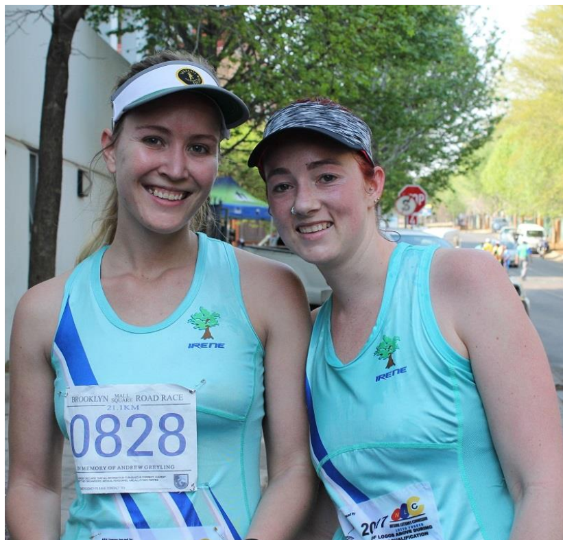
Always nice to see new members in their full Irene outfit