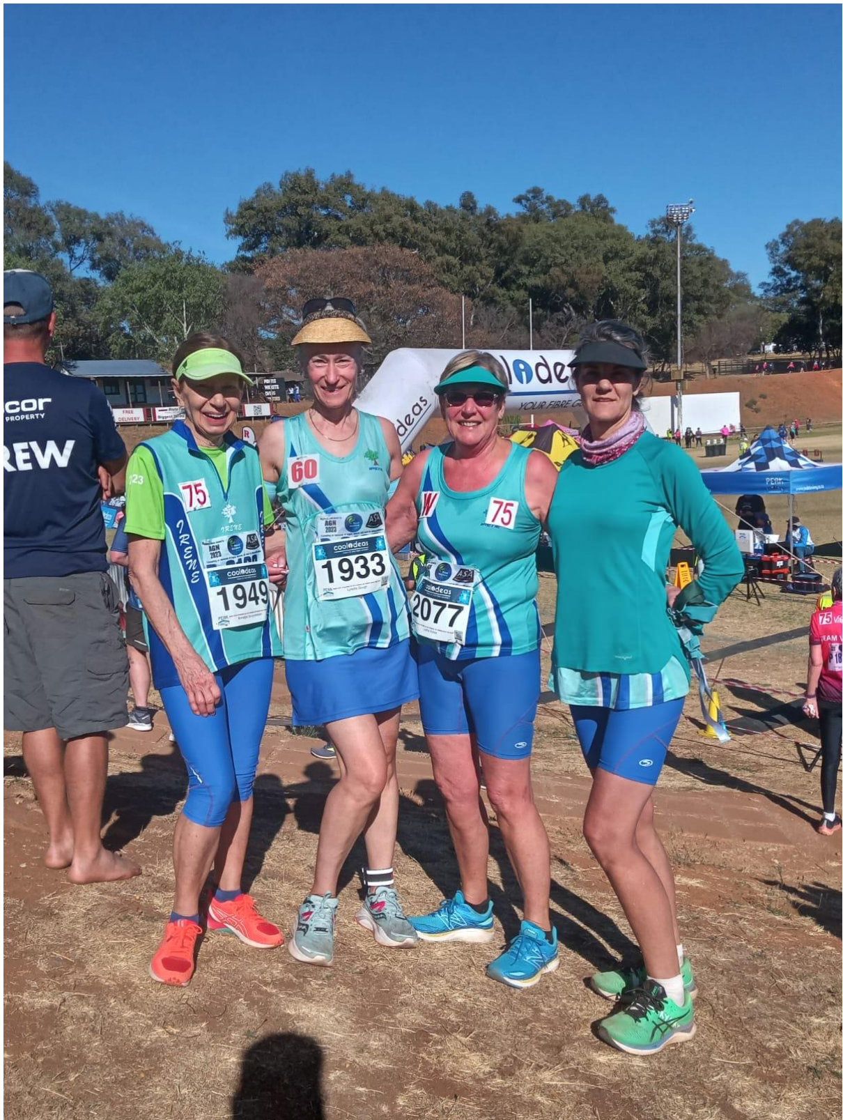
The "Queenagers" again on Sunday at the Pirates 10 km