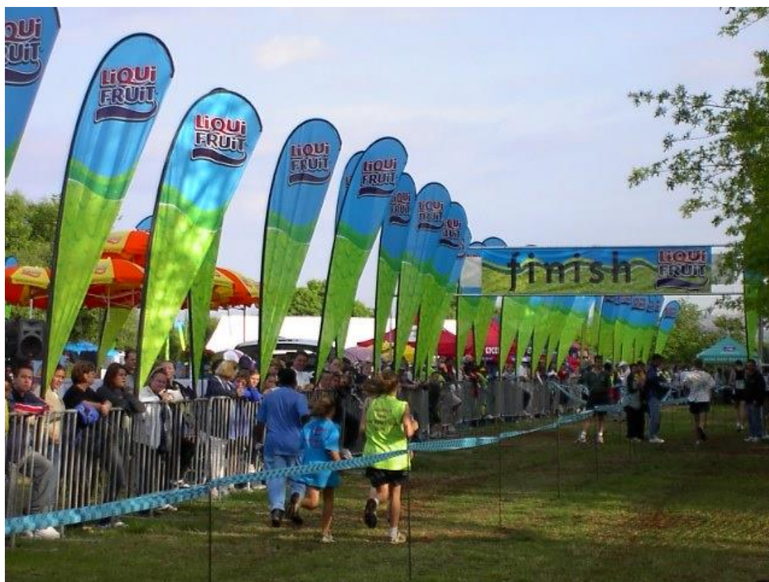
The finish of the 2003 LiquiFruit Race (The CSI Farm Race)