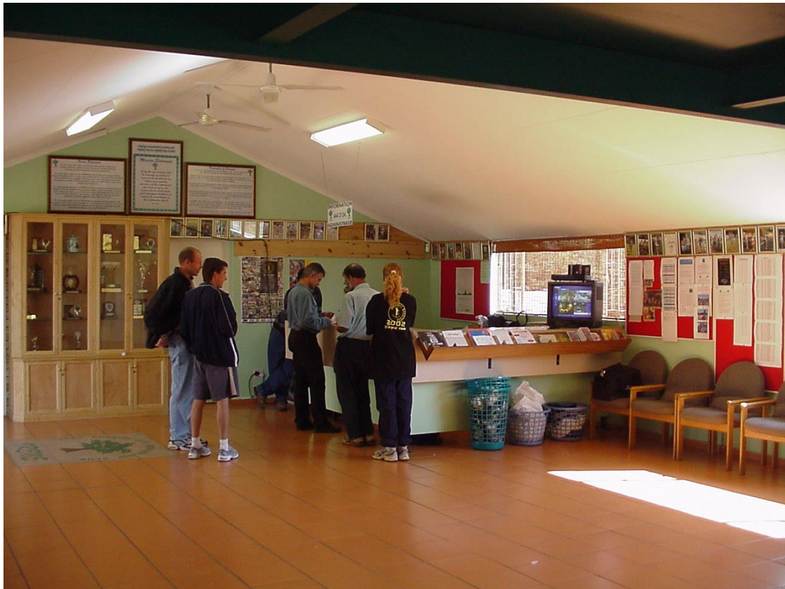
The admin counter in 2003