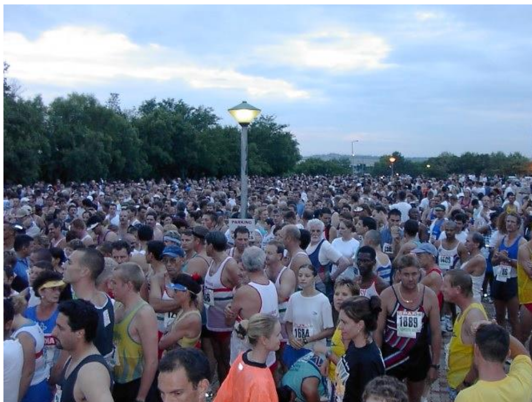
Runners lining up at the start of the 2003 Lantern Race