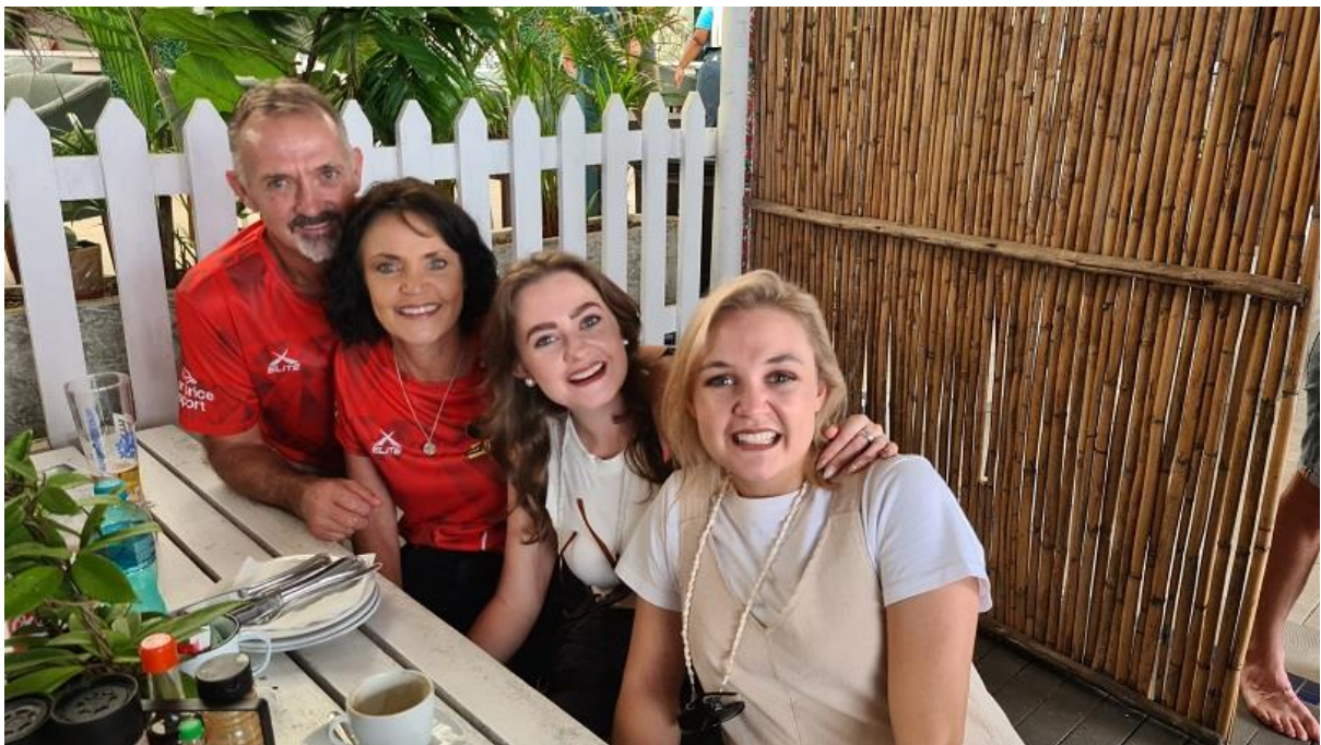
The Prinsloo family