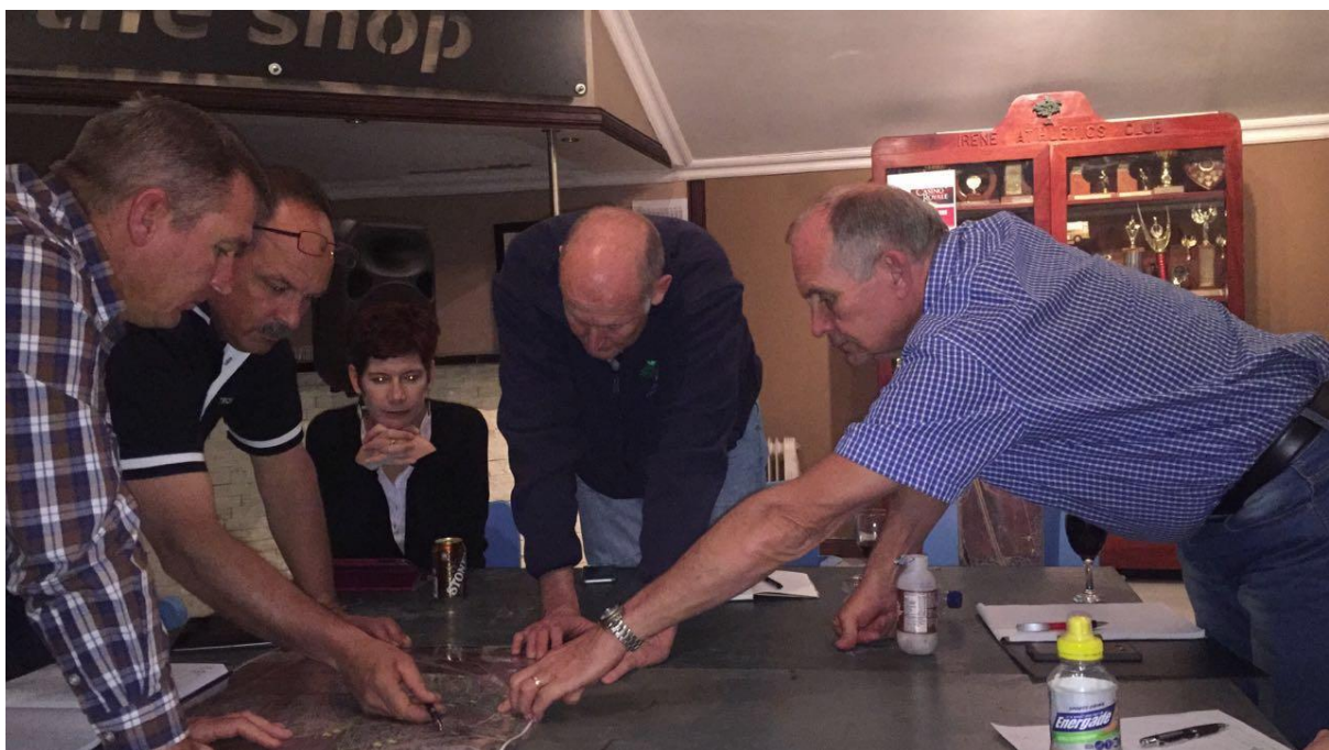
Members of the Race Committee busy with serious planning at the last meeting