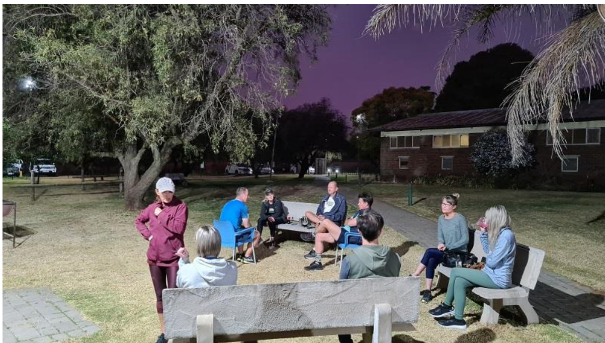
The atmosphere on Tuesday evenings is very special