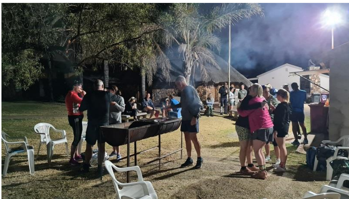
All members are invited to enjoy the lovely evenings on Tuesdays