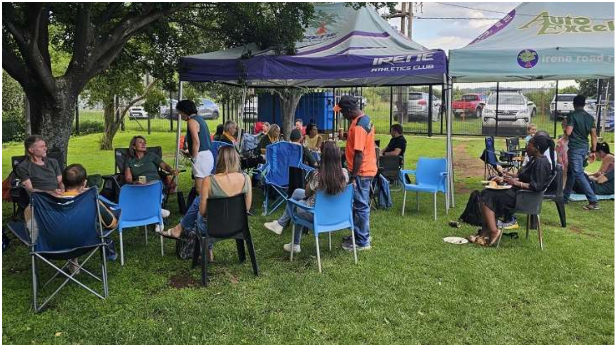
Members enjoying each other's company