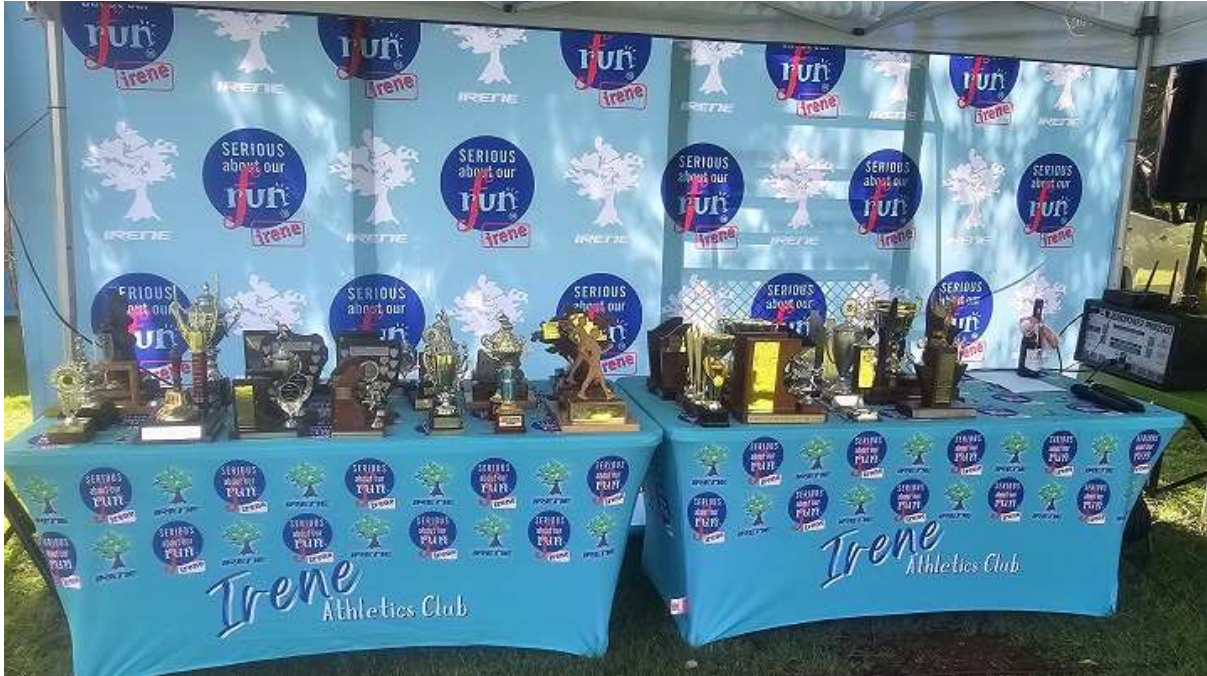
The trophy table on Saturday