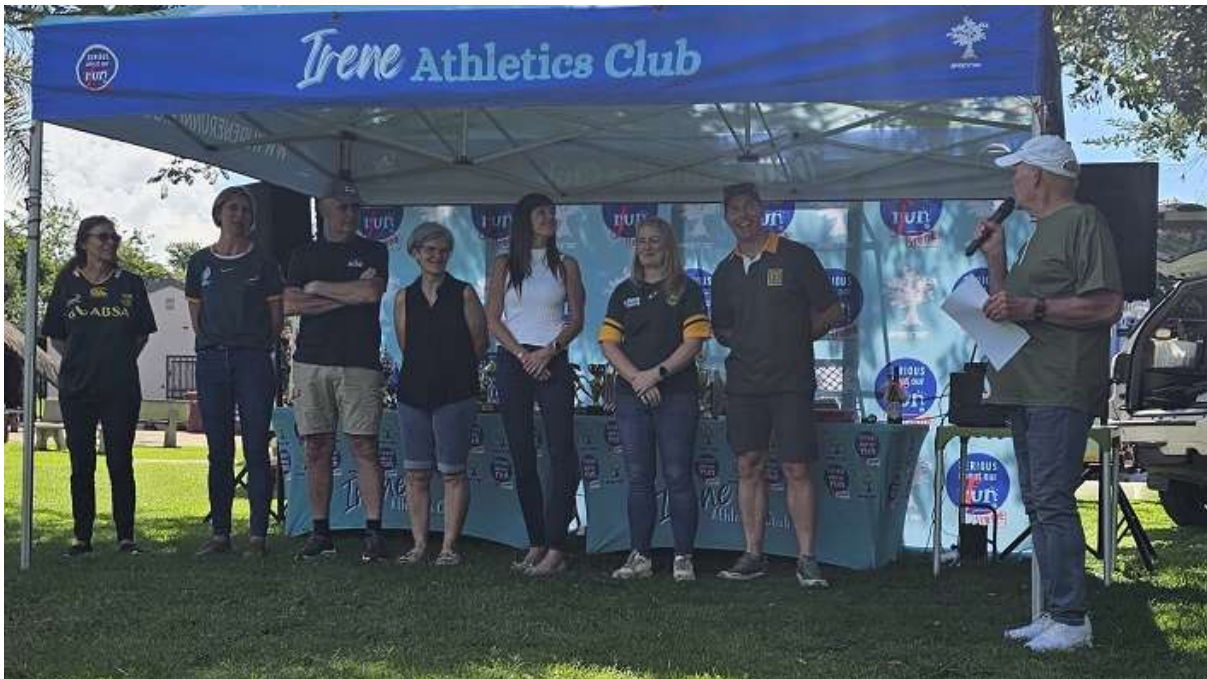
Introducing the new committee