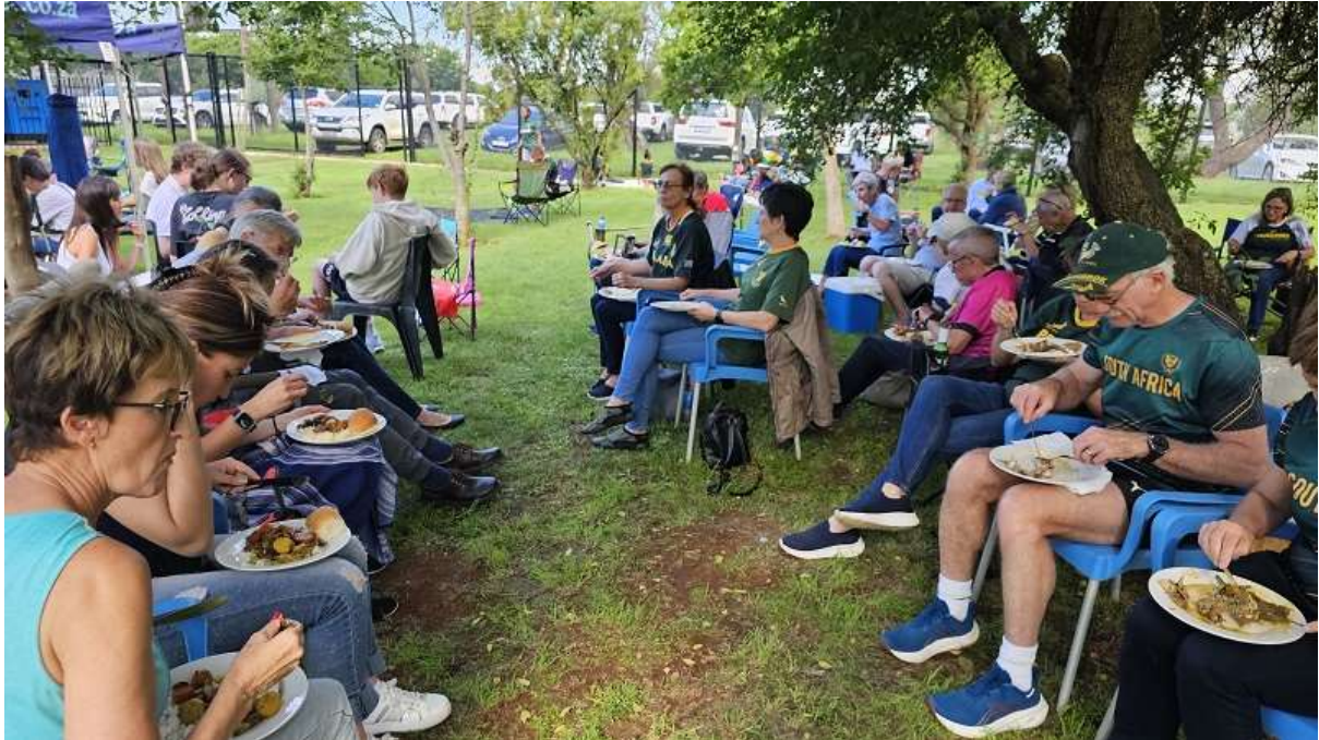
Relaxing and enjoying the food