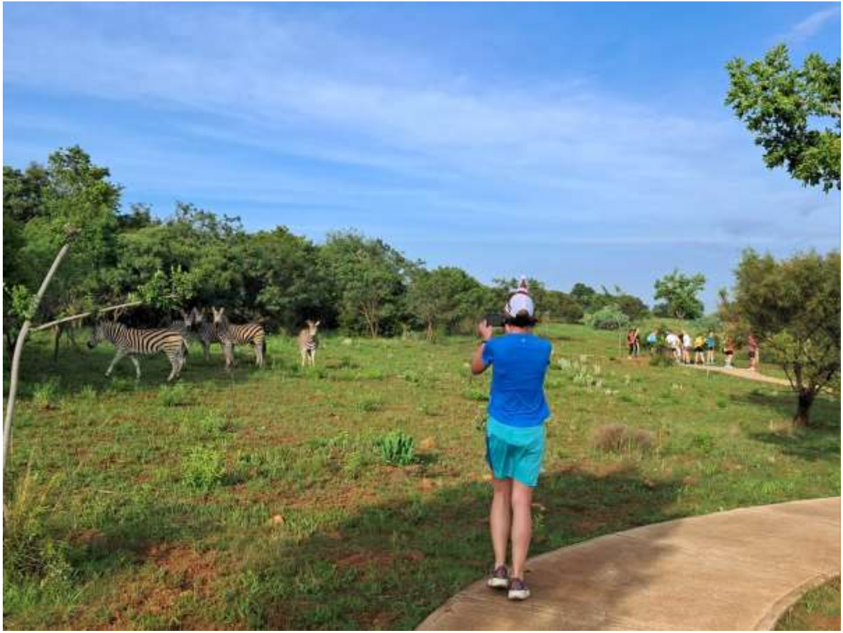
The run on Sunday morning was very special