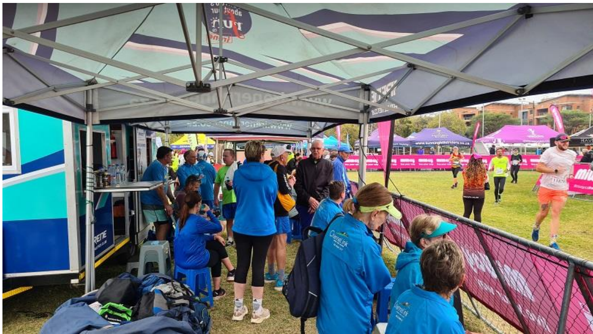
It was like the good old days at the Cara-Fun