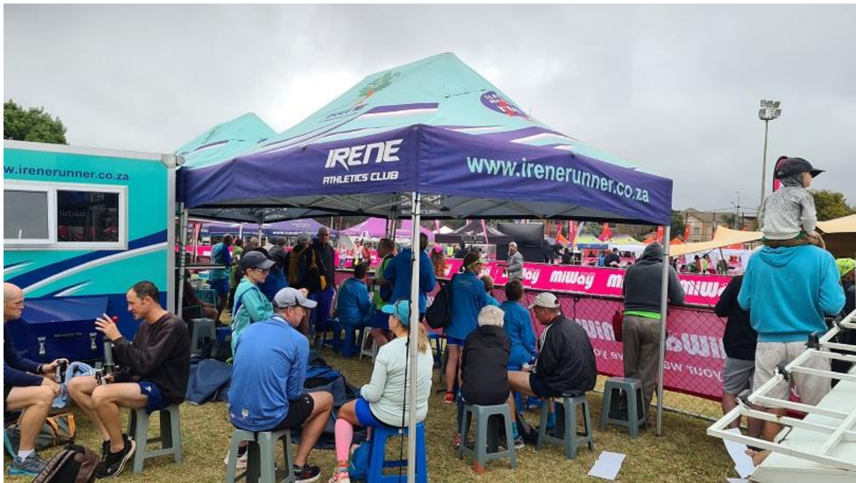
A popular spot as always