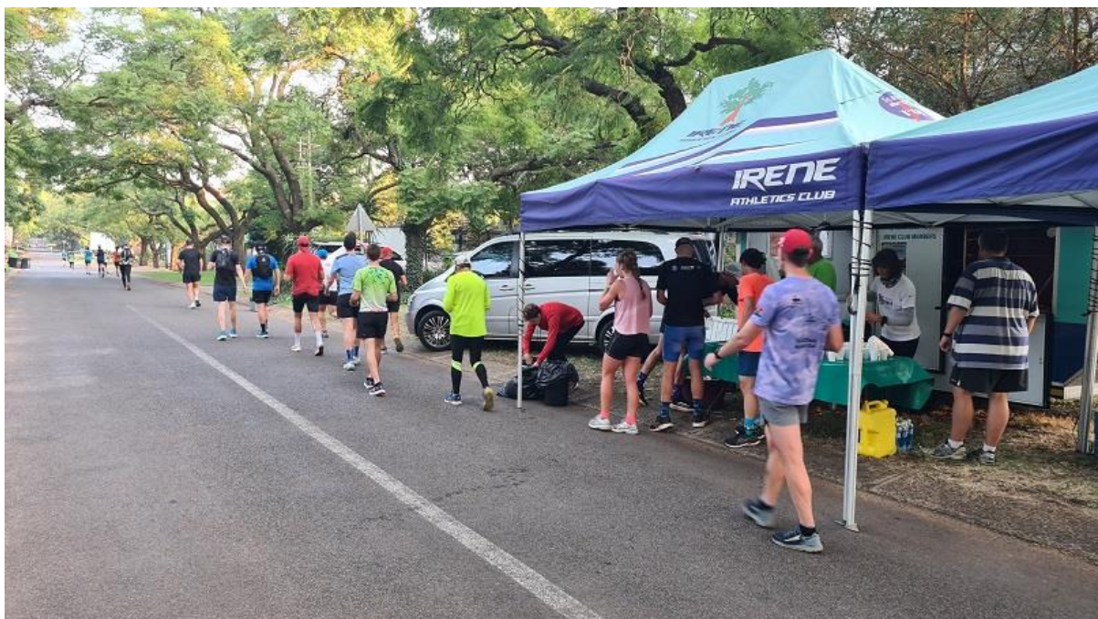
The Irene water point at the Magnolia long run was a huge success once again