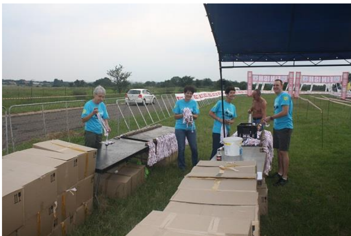
The medals are packed out