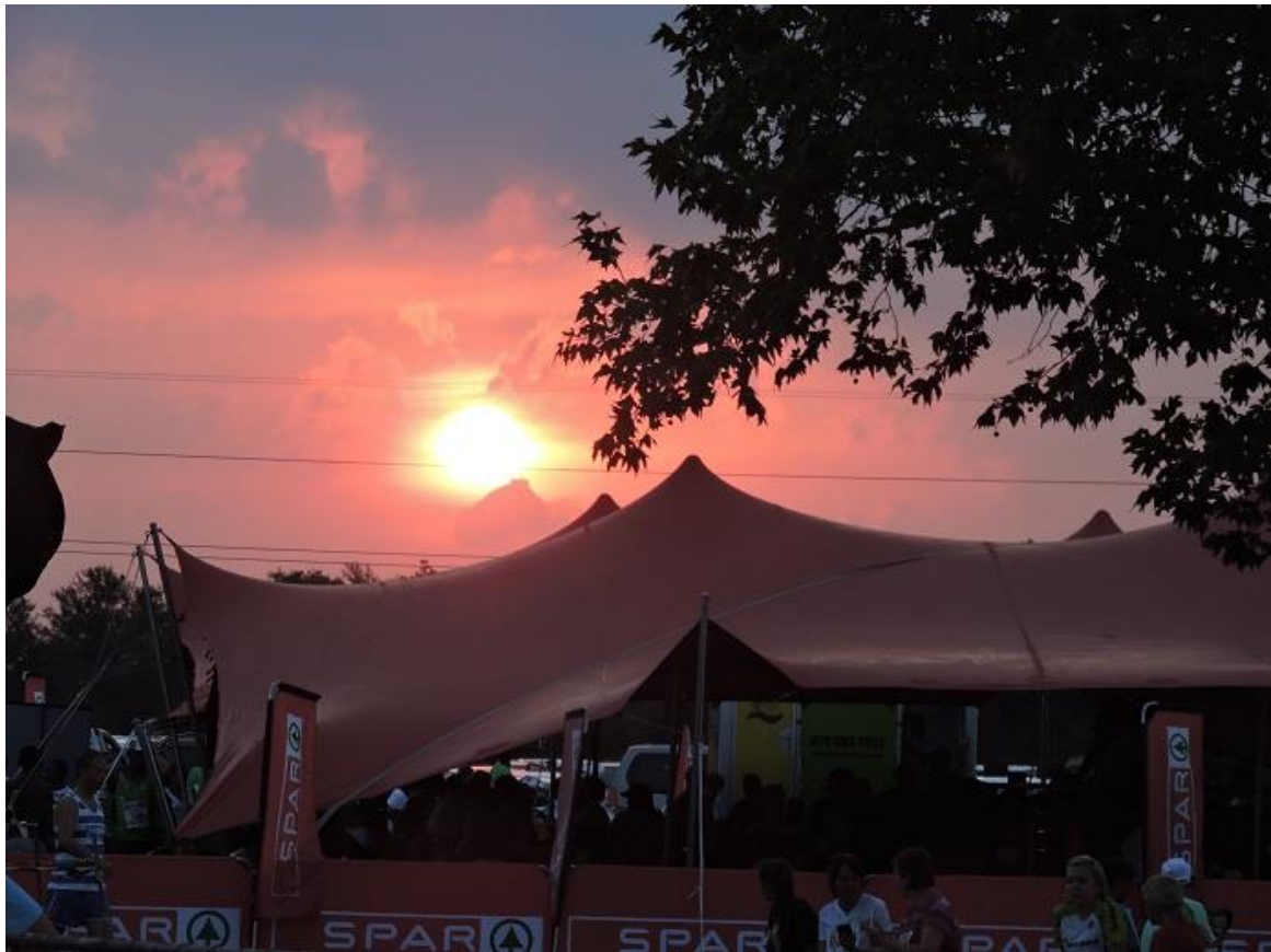
Sunset before the start