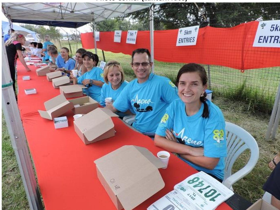
Ready for action at the entry tables