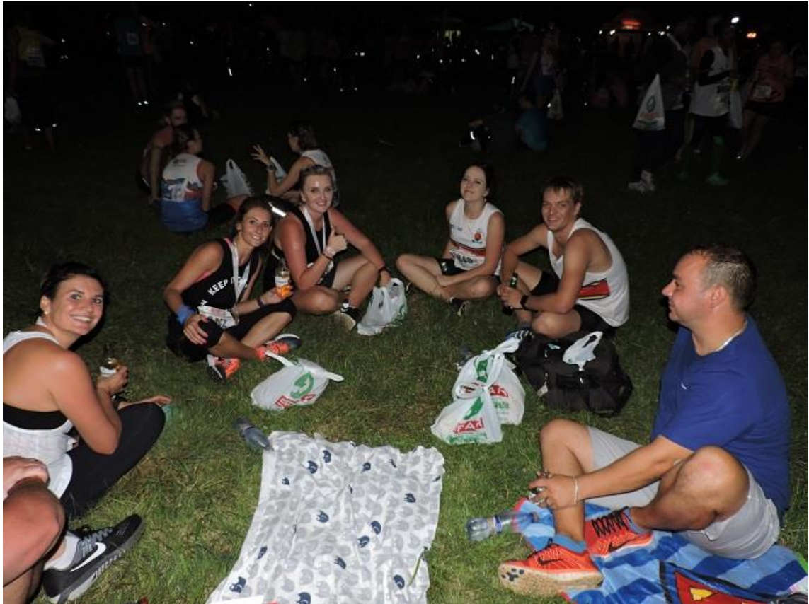
Athletes enjoying themselves after the race