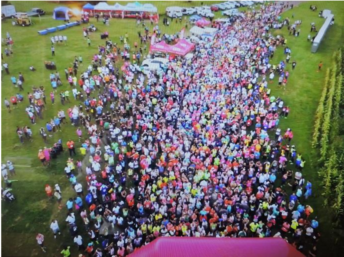
Athletes gathering at the start