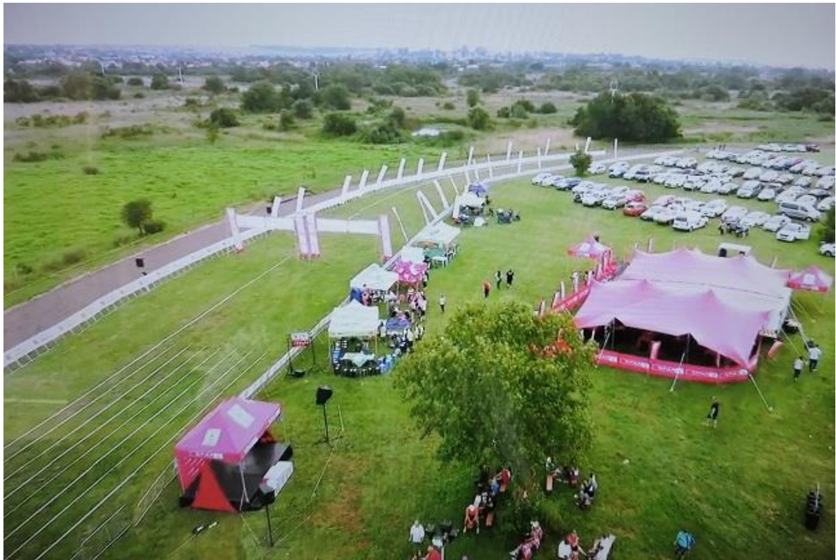
A bird's eye view of the finish outlay