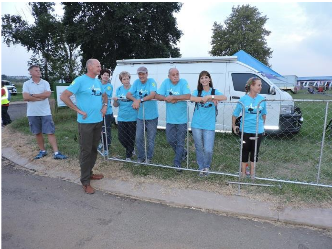
Waiting in anticipation for the start