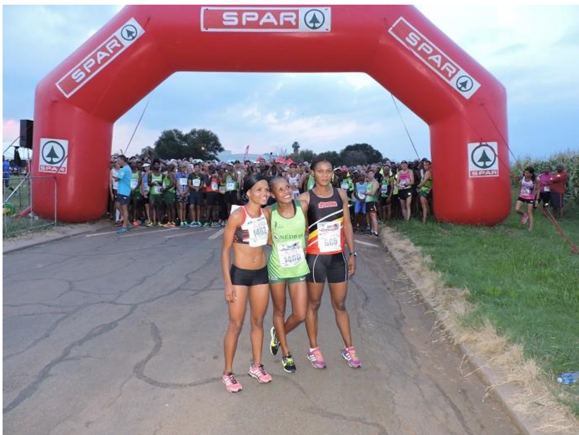
The three top ladies at the start