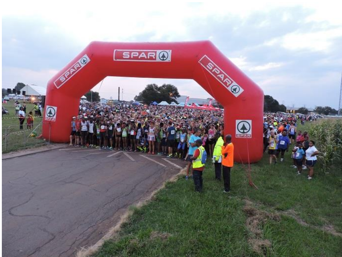
Ready to go