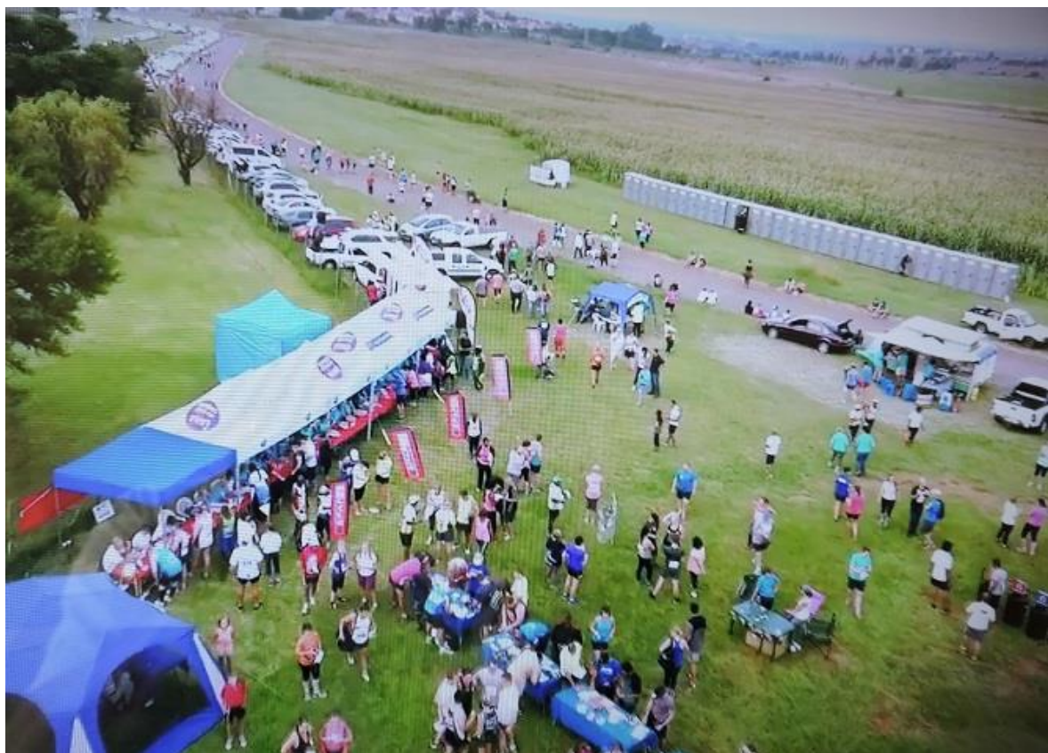
Activities starting to increase at the entries