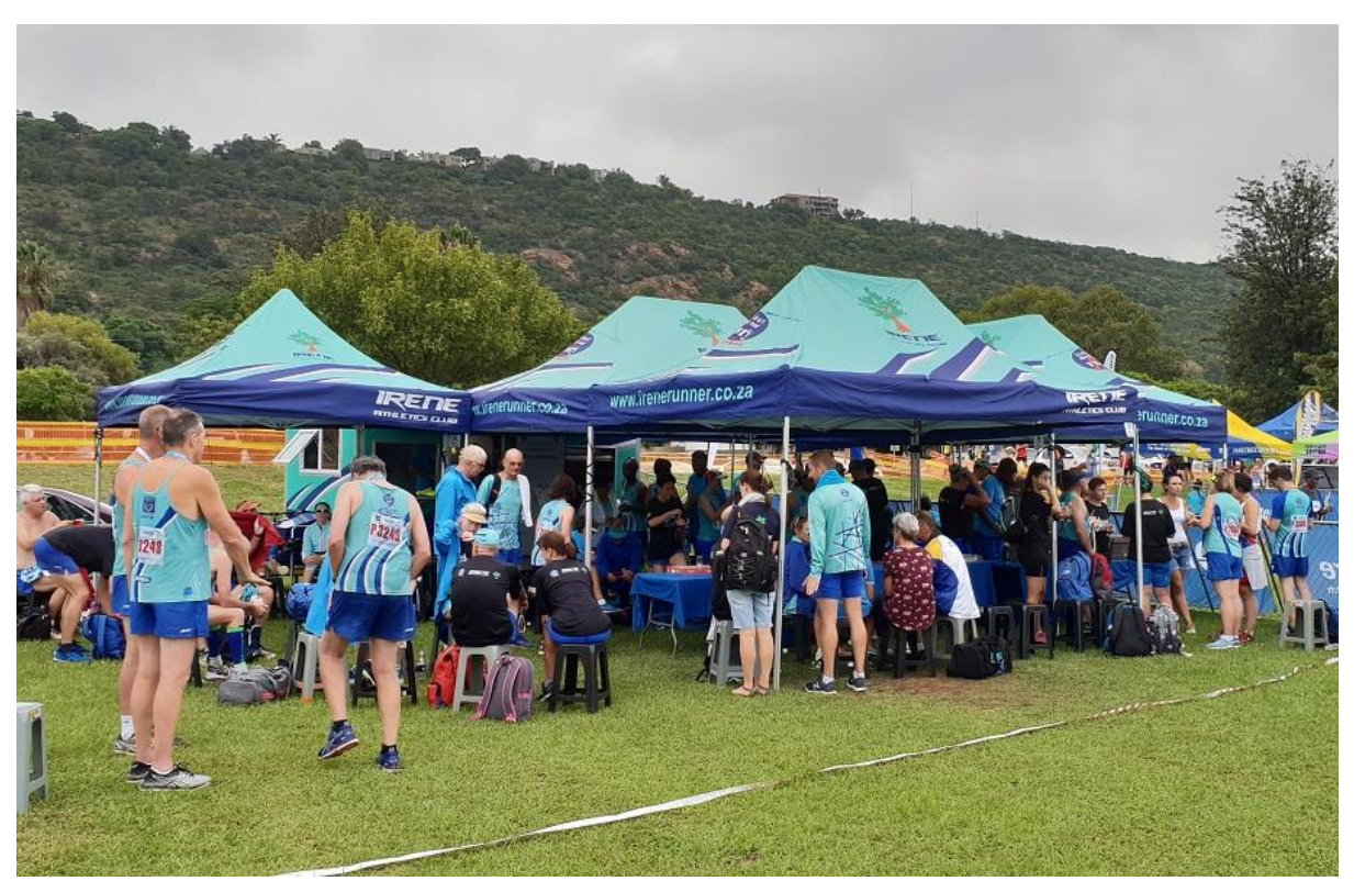
Our Cara-Fun and gazebo's at the Intercare Classic Race last year

There will be watermelon and snacks at the Cara-Fun afterwards.