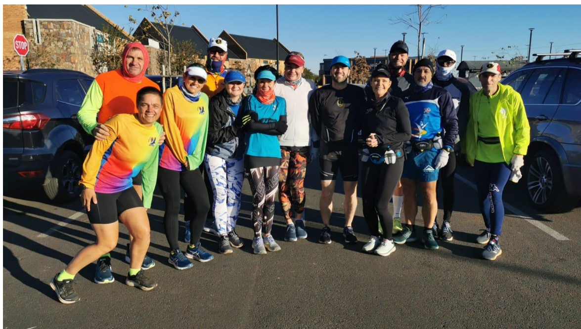
The training group on Thursday morning