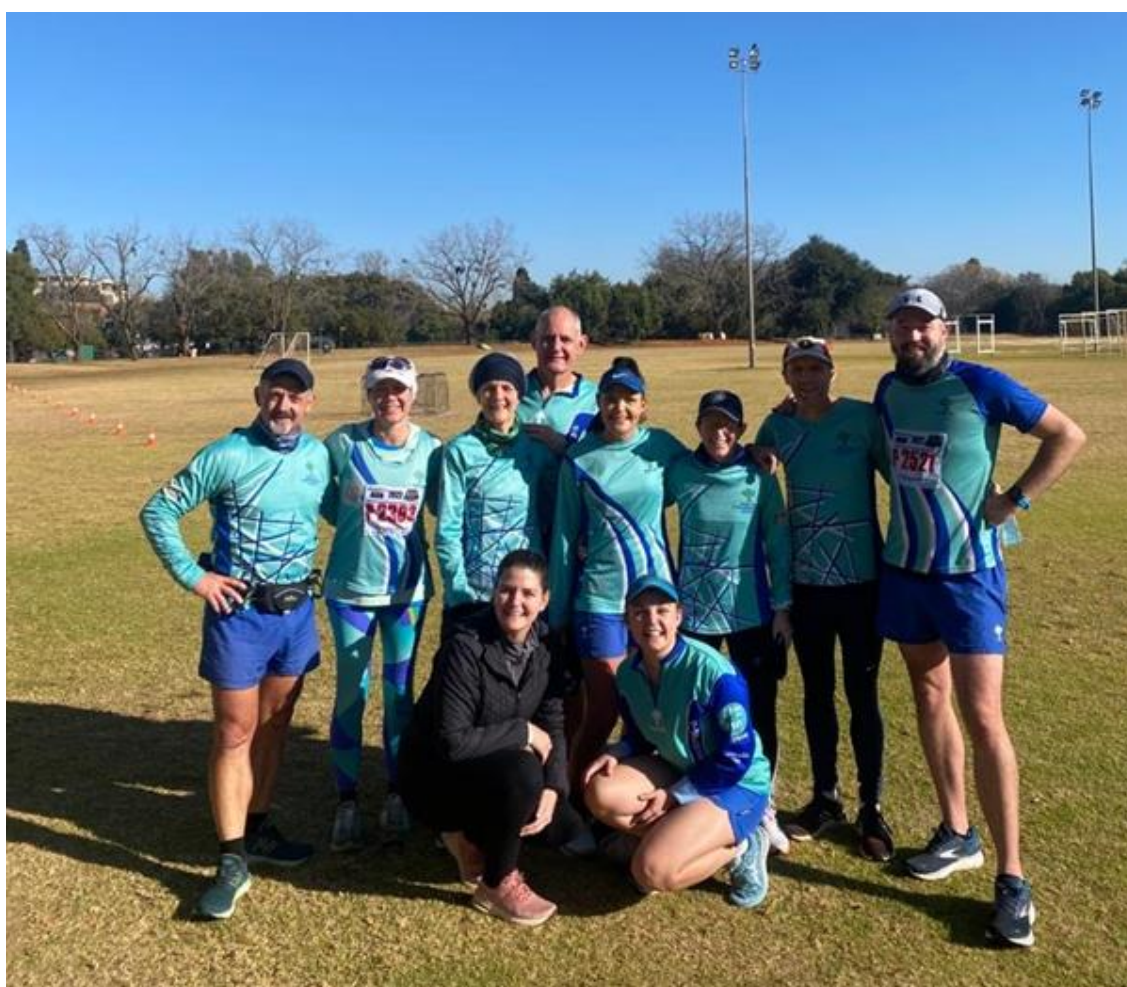
Phobians Club winter Challenge