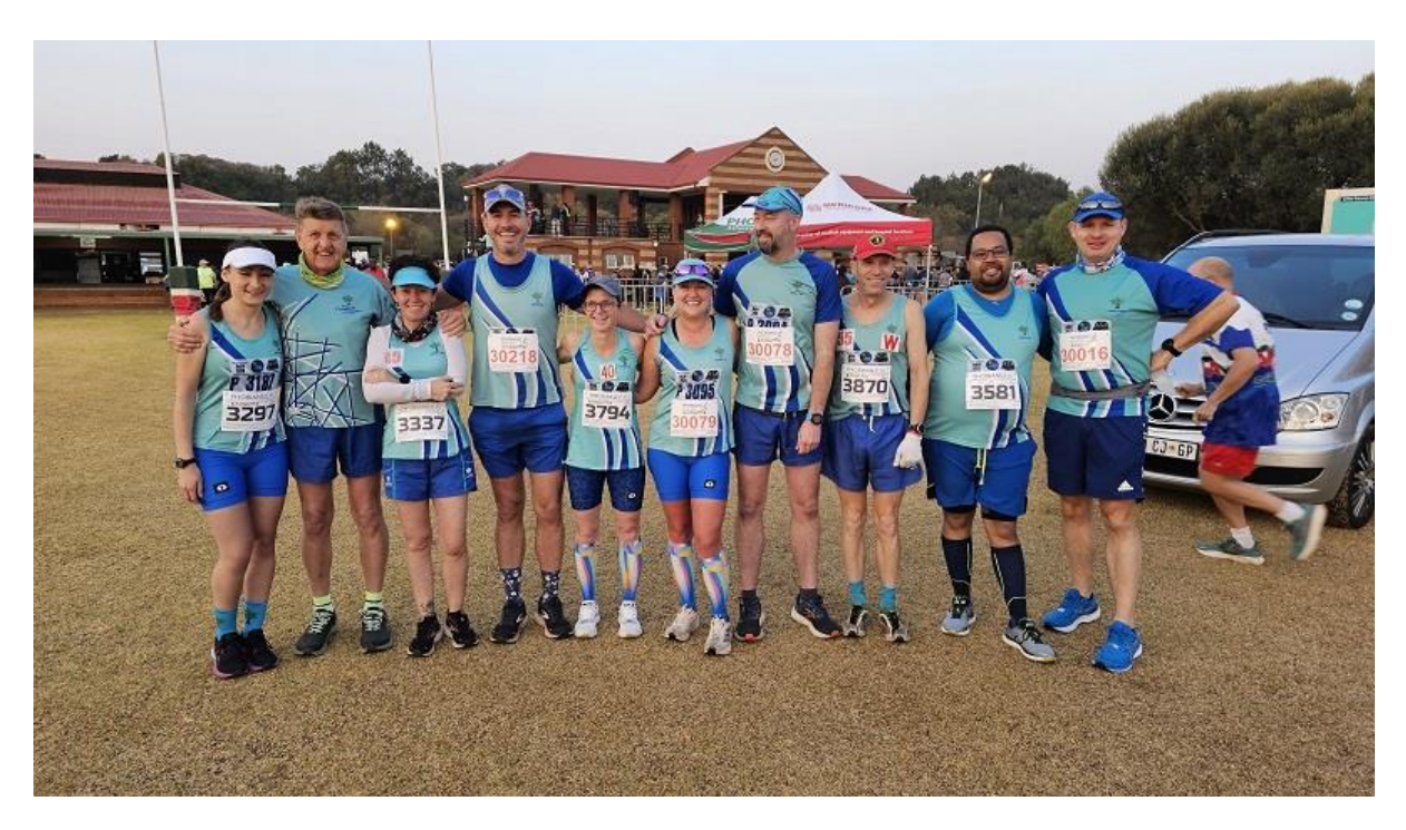
Ready for action at the Phobians 15 km