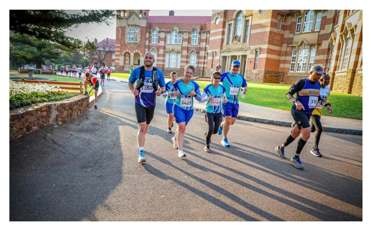
Running through the Boys High terrain is very special