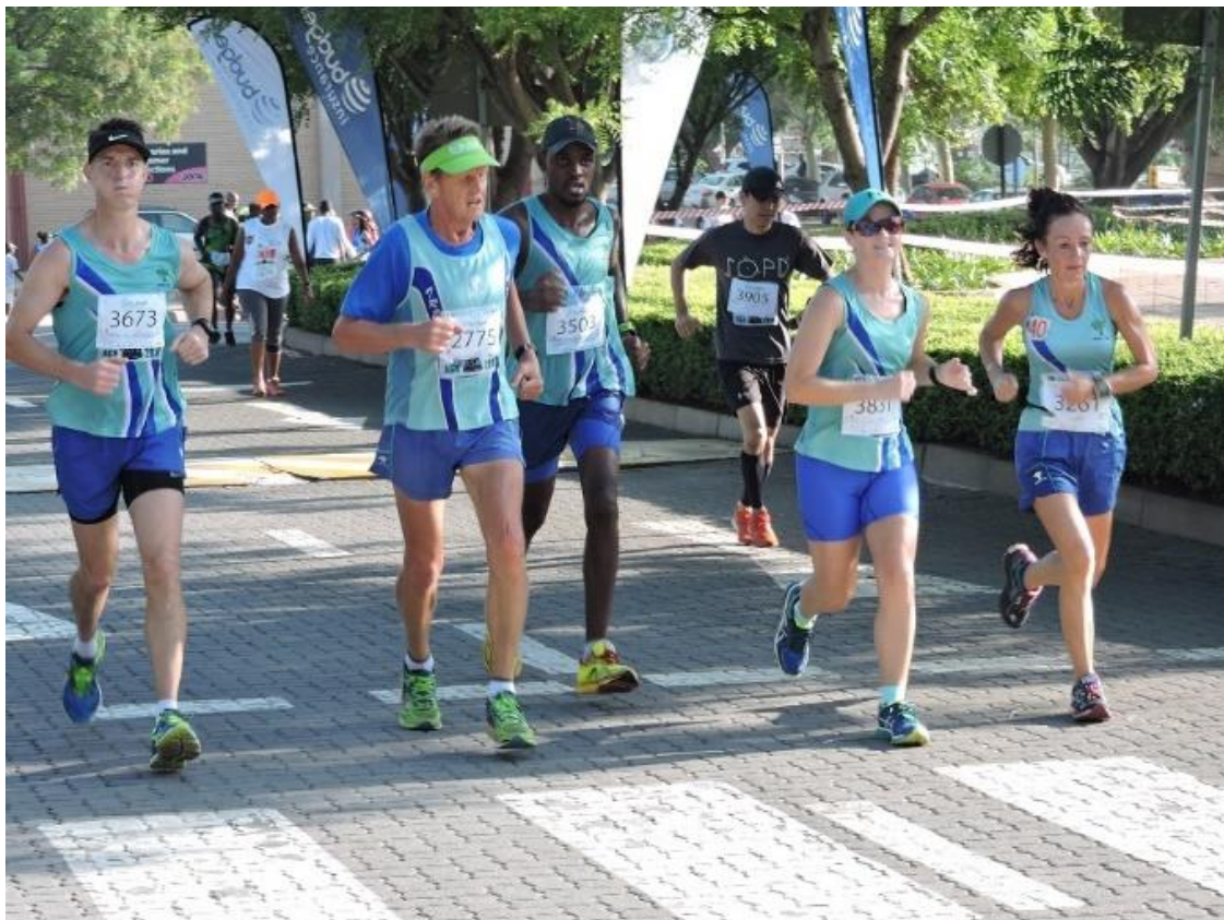
Always a lovely sight to see an Irene "bus"