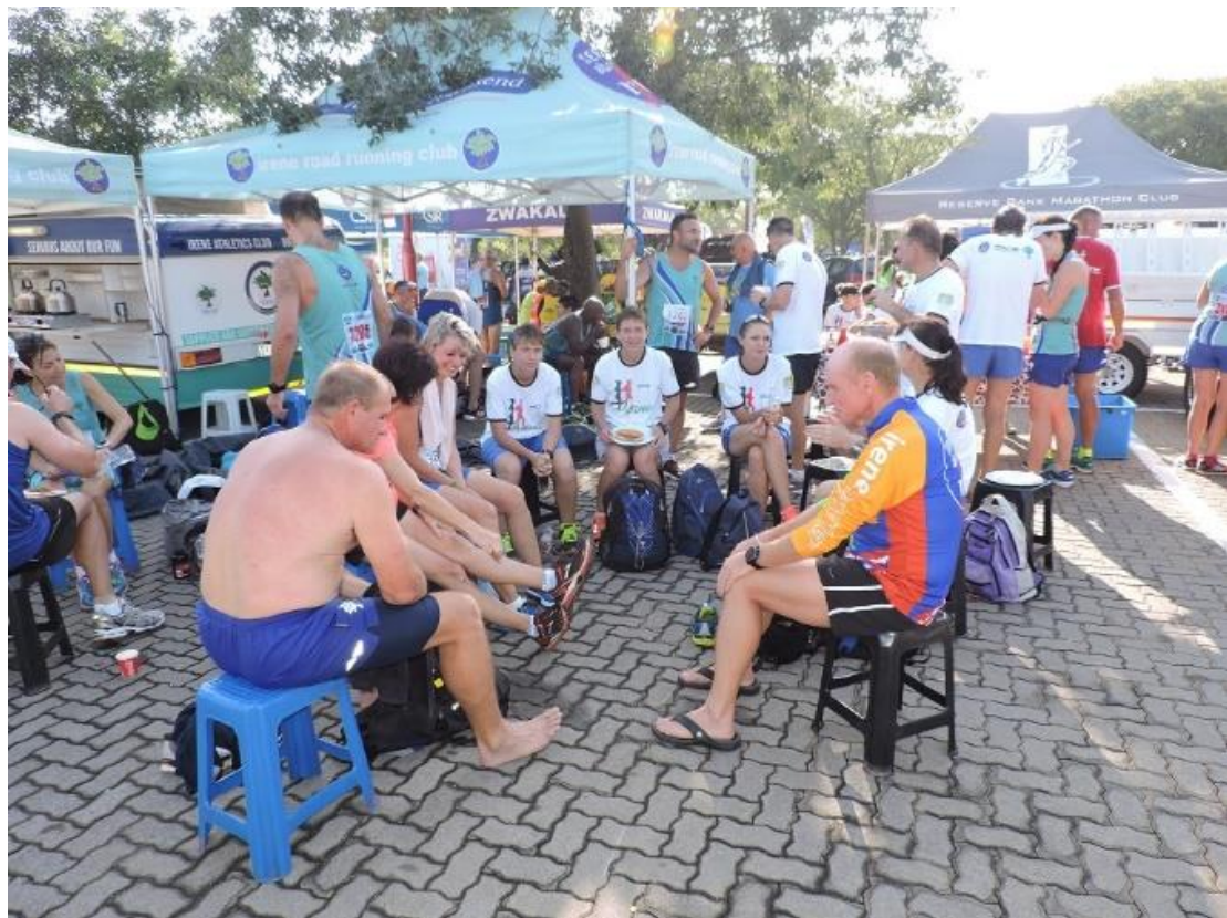
Members relaxing at the caravan and gazebo