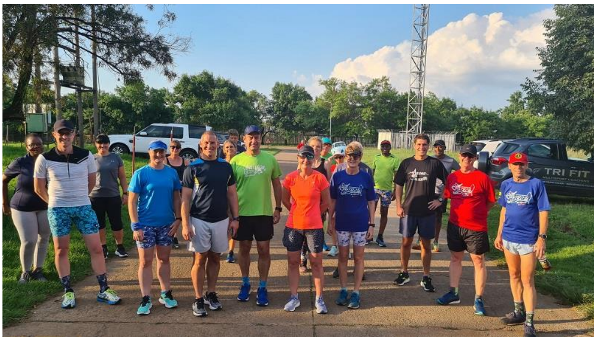
Ready for the time trials