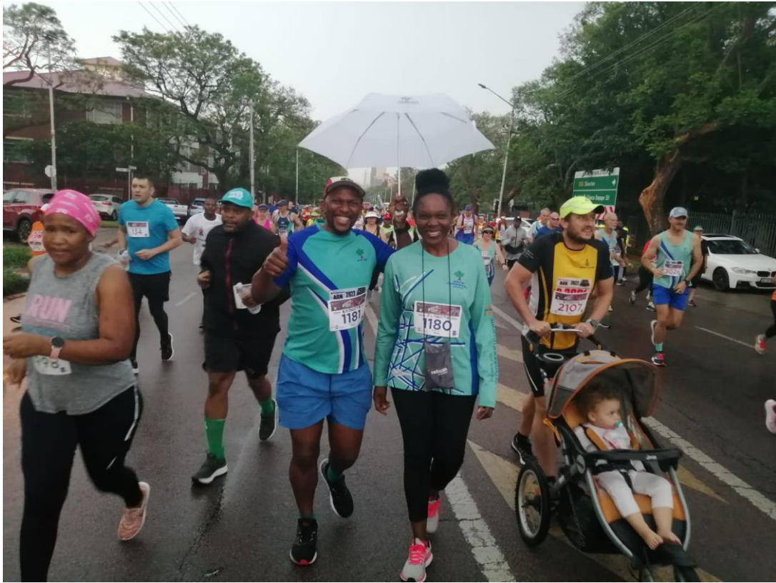
Action at a wet Tom Jenkins race on Saturday