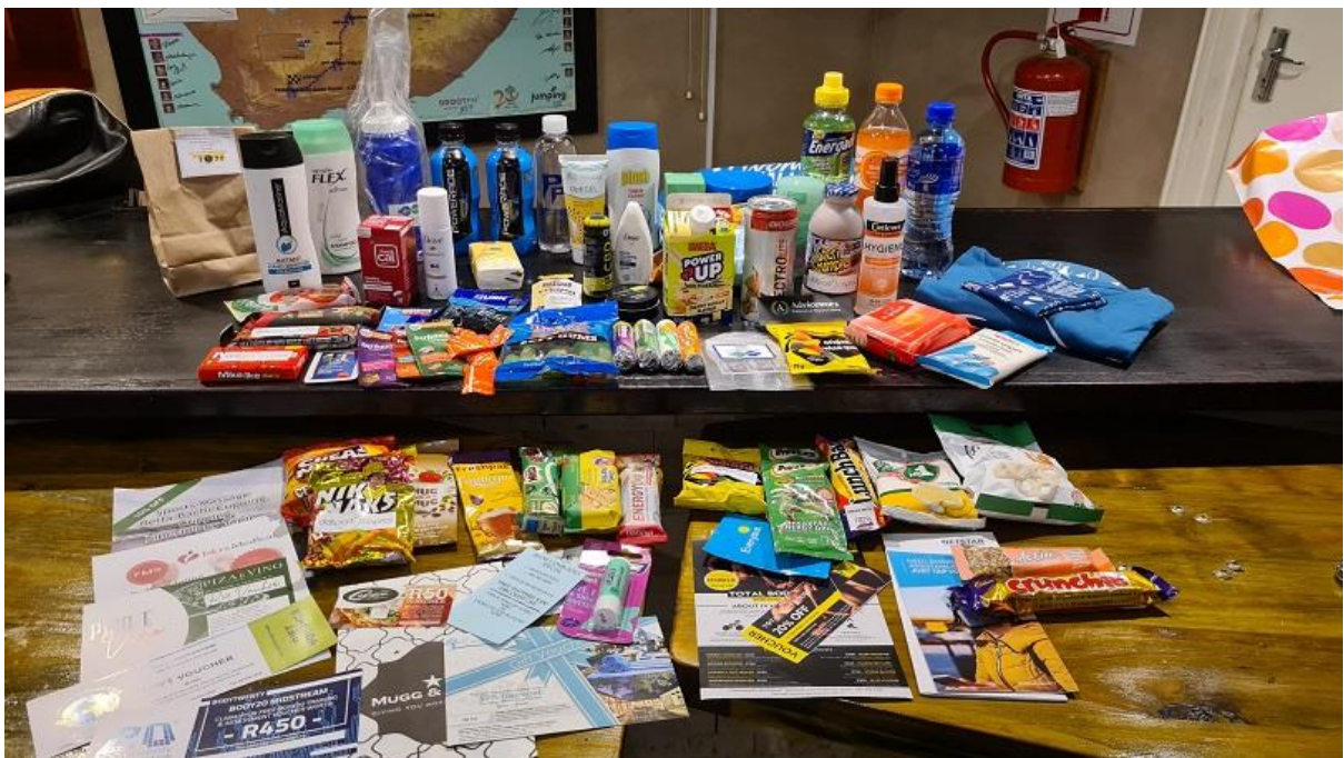
The contents of the Comrades goodie bags, something special