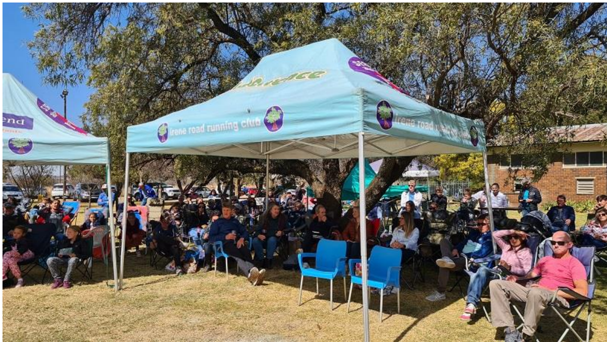
Part of the crowd at the Comrades pre-function