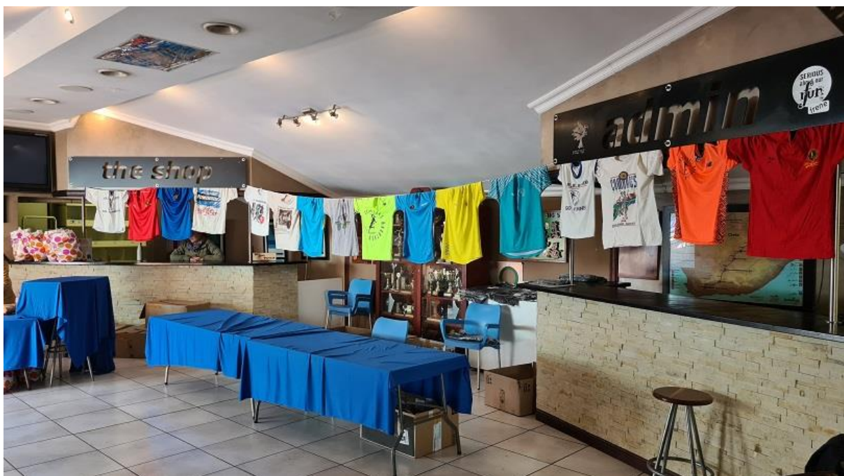
Previous Comrades T-shirts as part of the decorating in the club house