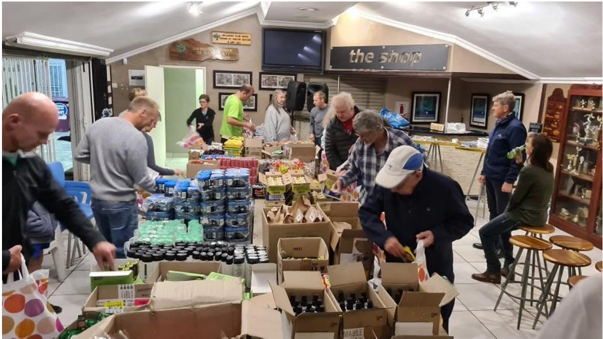
Goodie bags packing