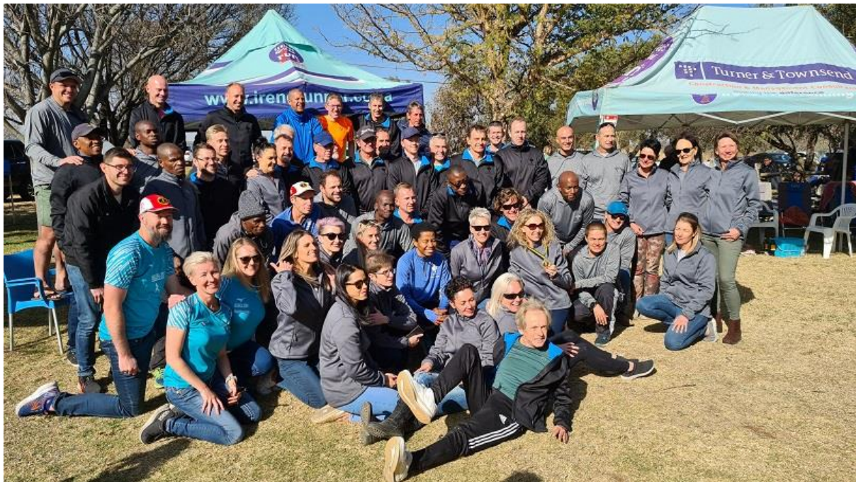
Some of the “Team Irene” members