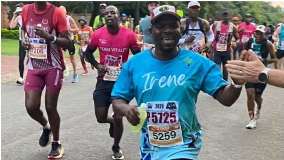
Prince Nemutanzhela enjoying the support at the Irene support station