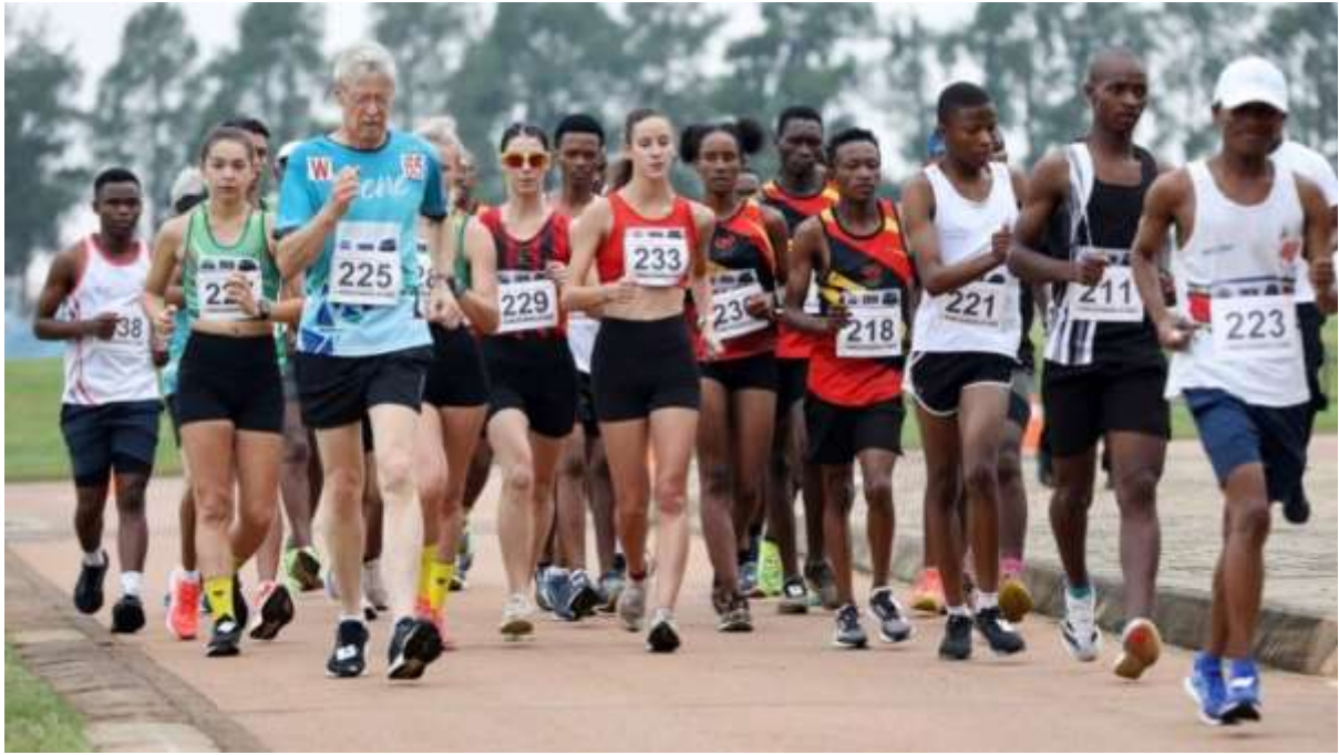
The walkers on their way in the 21 km