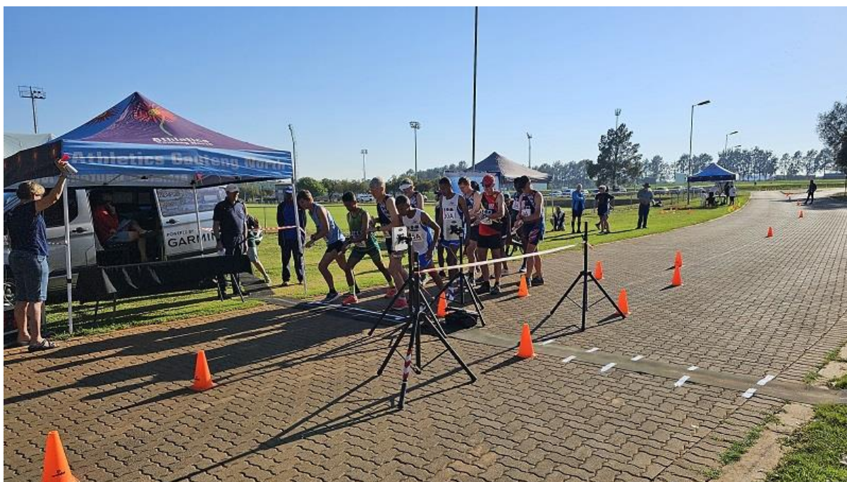
The start of the 40 km relay championships