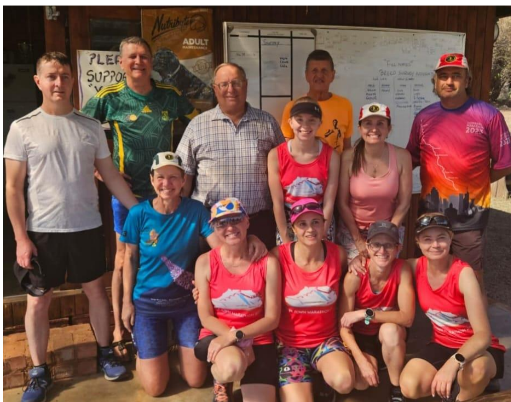
Irene members at the German Shepherd Club for the IAD October event