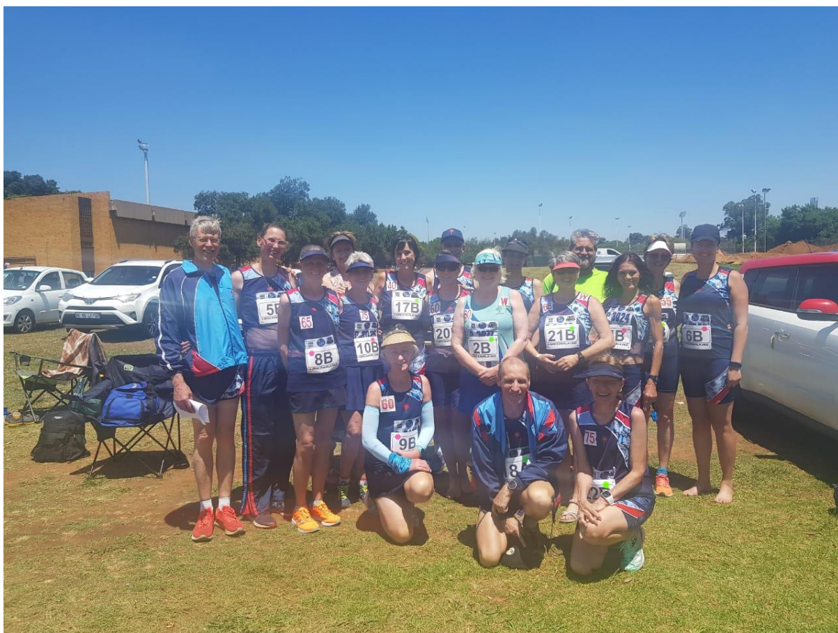
Irene members formed the biggest part of the AGN team