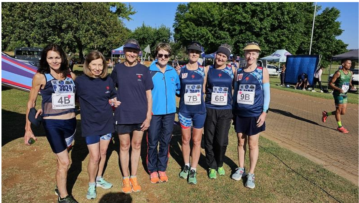
A few Irene ladies before the start of the relay championships