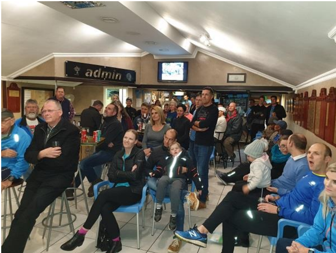
Everybody enjoyed the evening