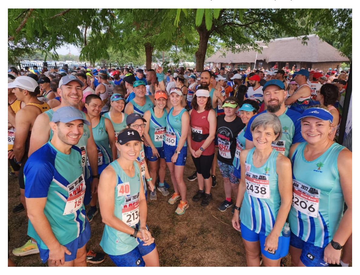
A few Irene members at the start