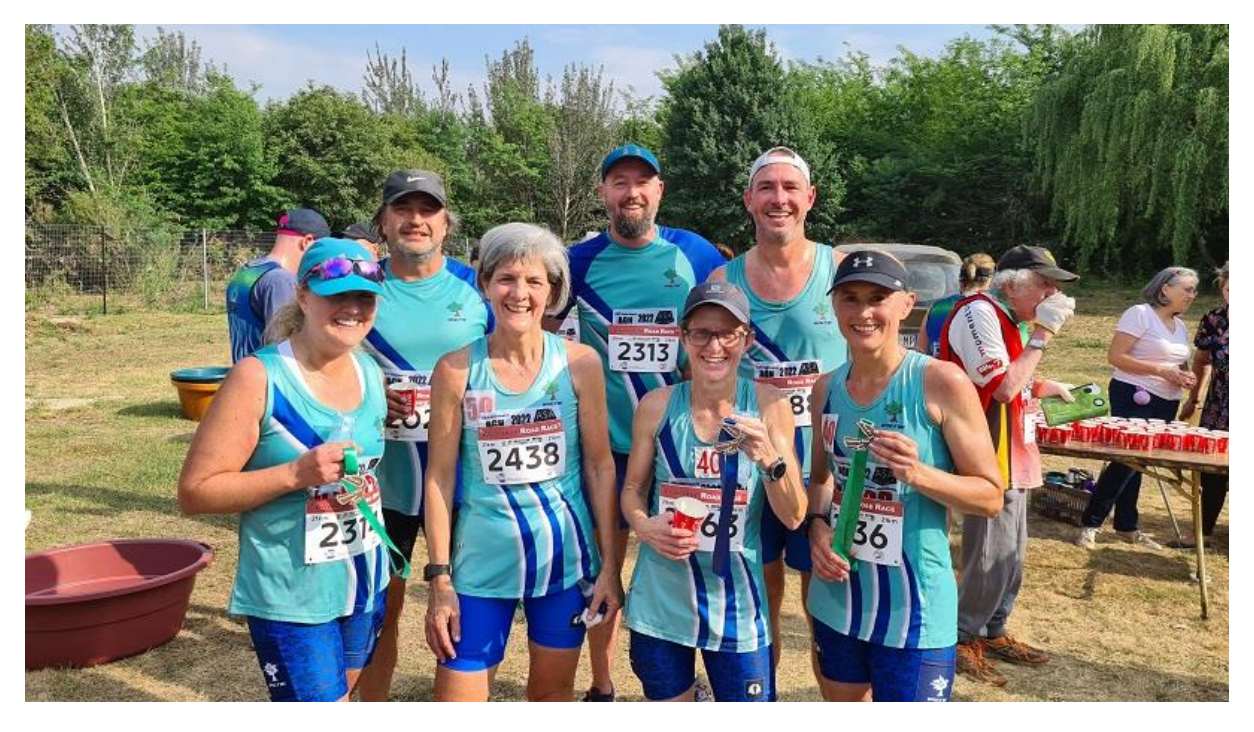
Happiness after completing the 21 km \,