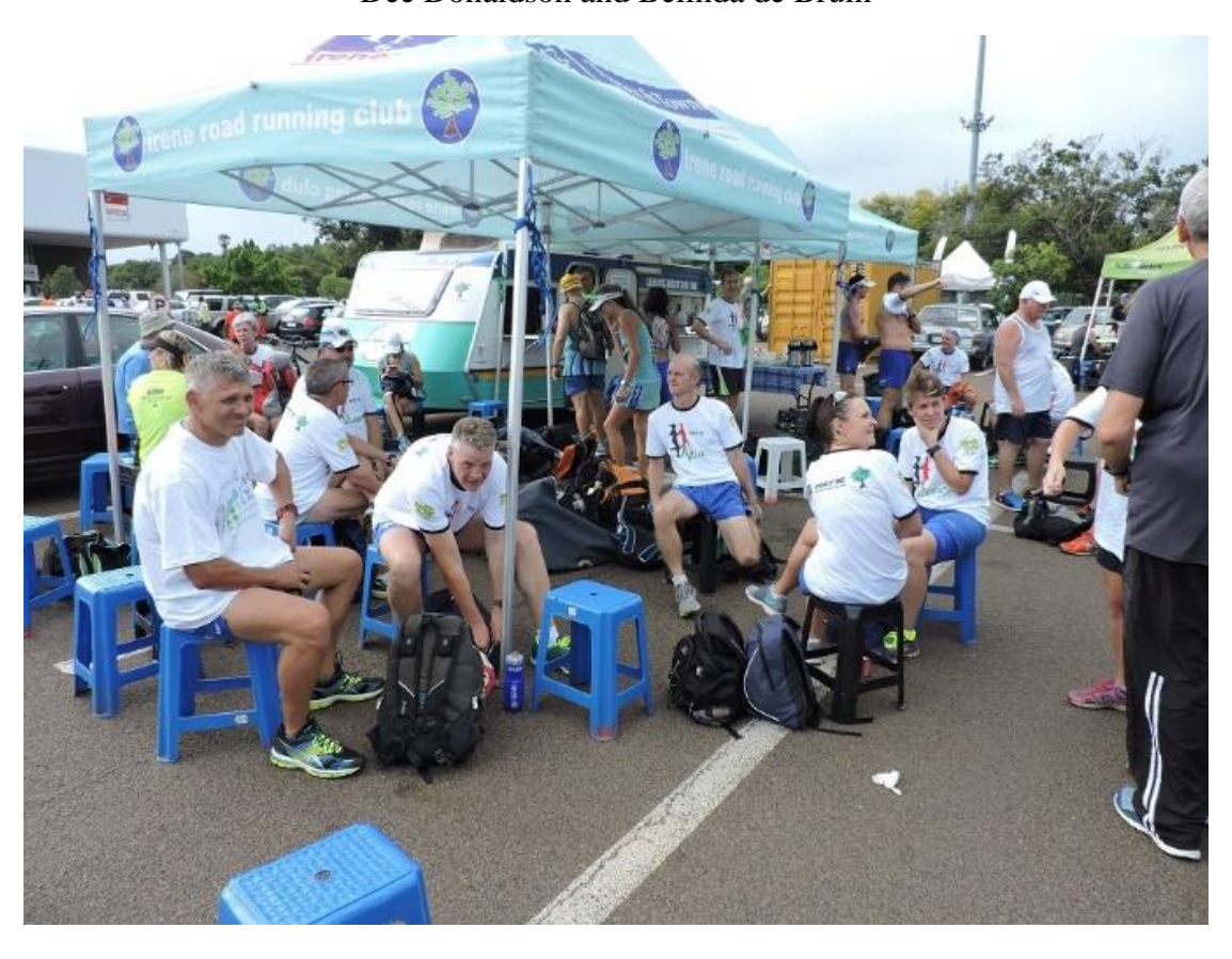
It is always nice to relax at the gazebo after the race