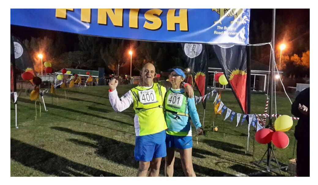
At the finish after a gruelling 161 km