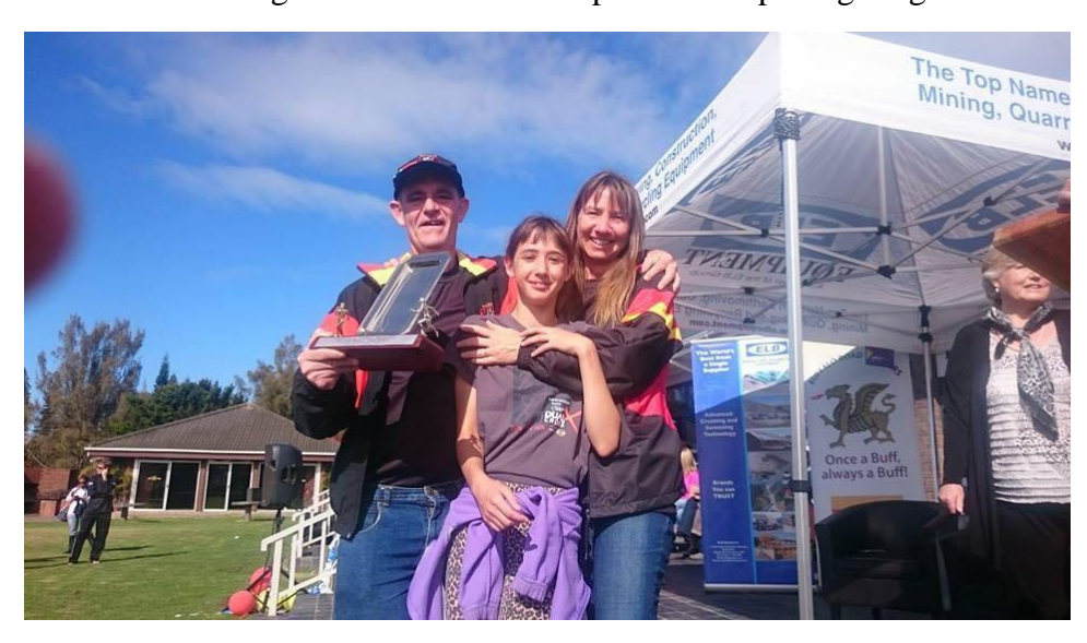
Winners of the Husband and Wife trophy