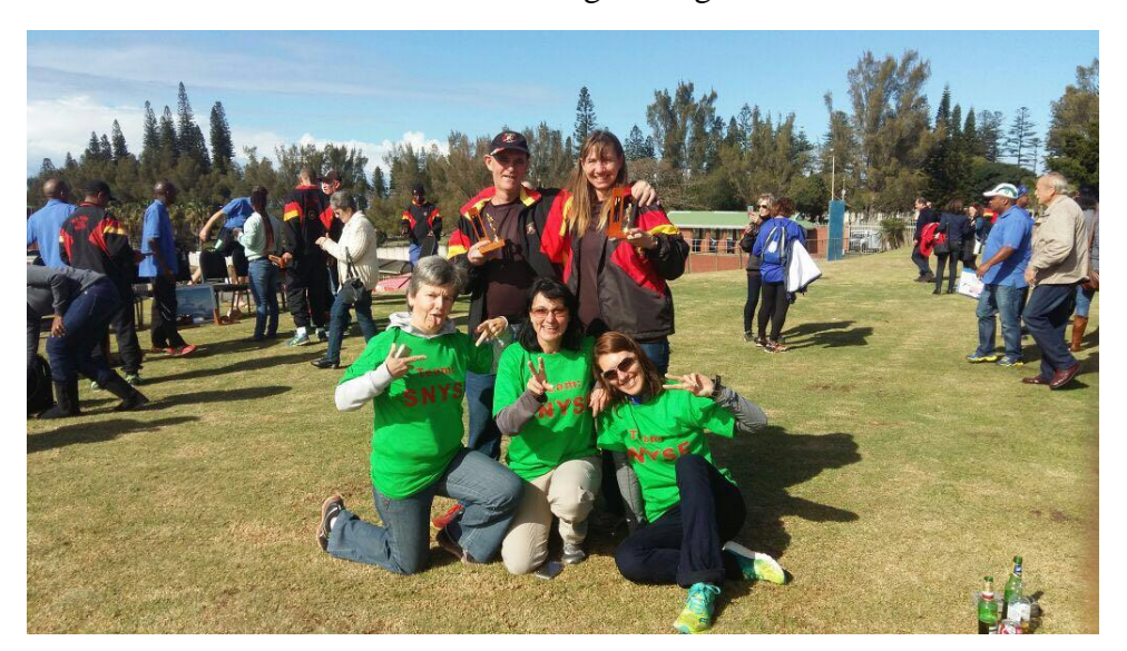
Wearing their track suits with pride at the prize giving