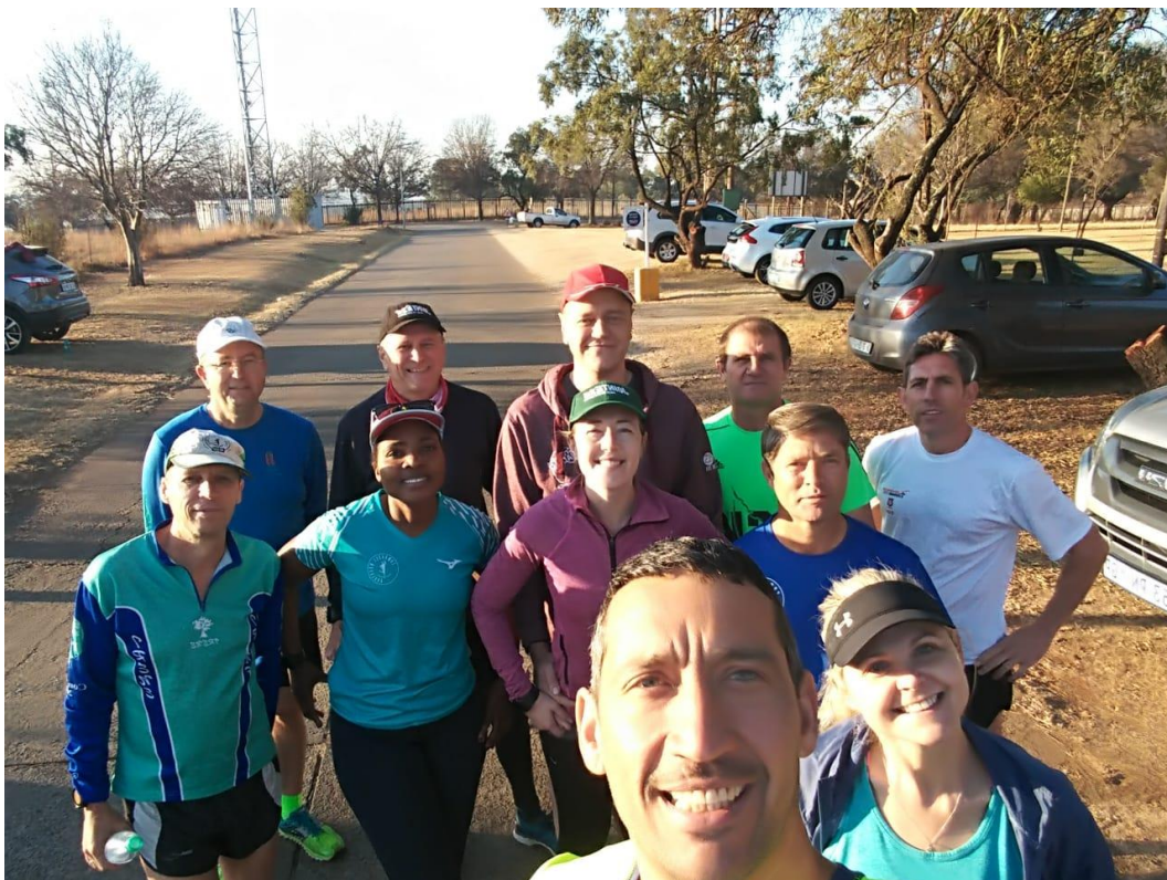
Runners at the club run on Sunday morning