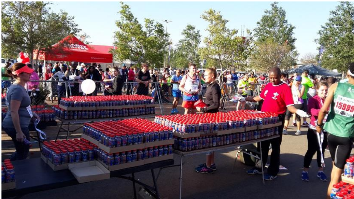
A total of 4800 bottles of clover chocolate milk was available at the finish