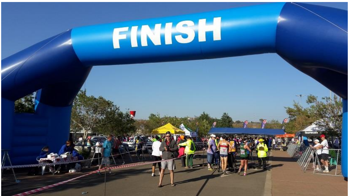
Our finish structure is something special