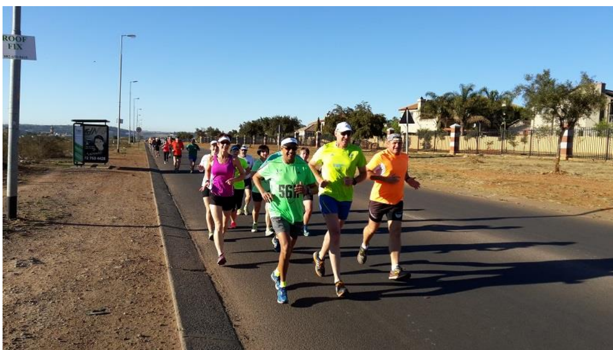
There was an excellent turnout at the helpers race