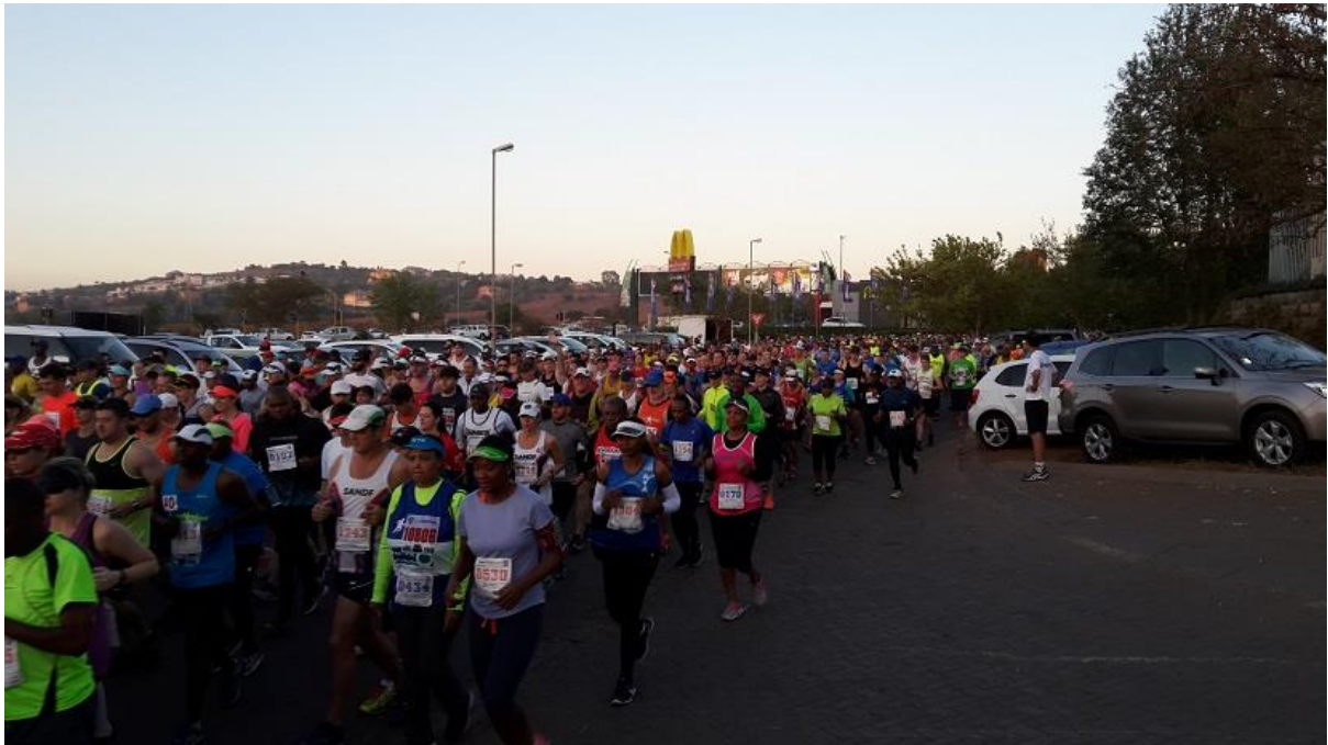
It was a huge turnout