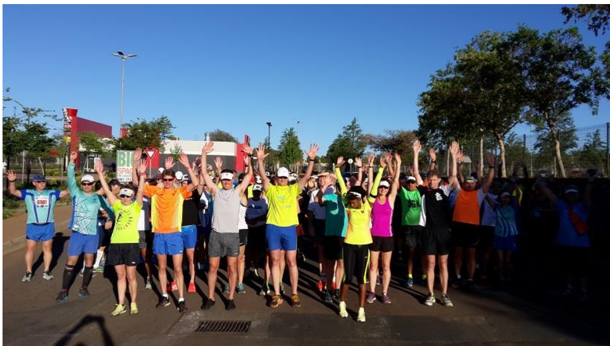
The start of the helpers run on Sunday morning