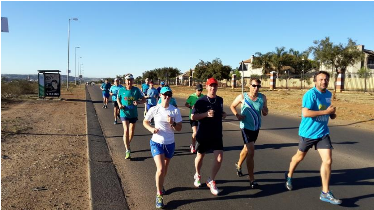
Runners enjoying themselves at the helpers race