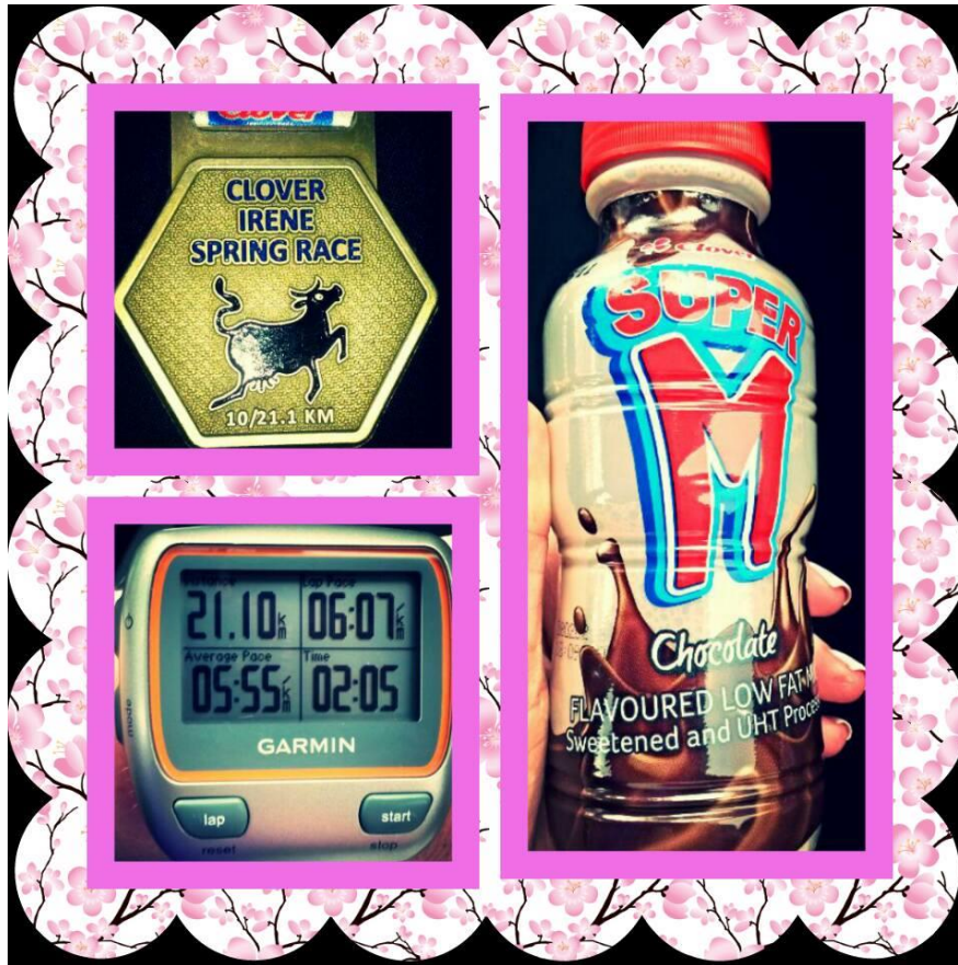
Photos from Facebook showing how the race was appreciated