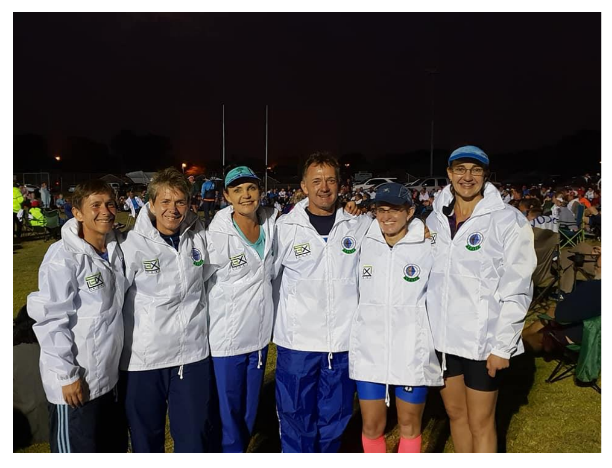
Showing off with their permanent number jackets! Well done to you.