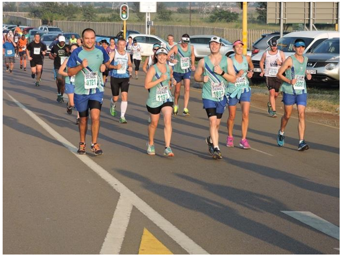
Irene members all over