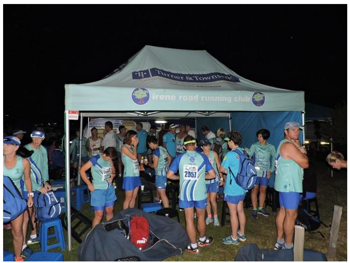
It was quite busy at the gazebo