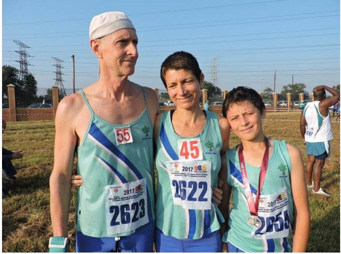
The Botha family