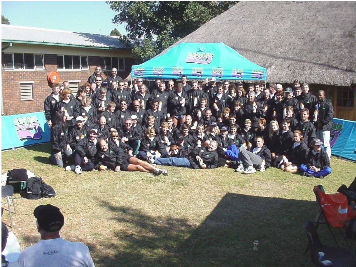
The Irene Comrades team of 2001