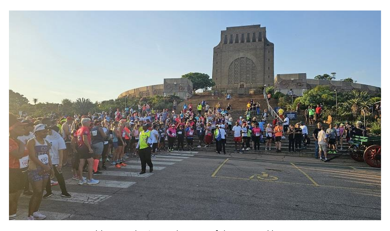
Athletes gathering at the start of the Voortrekker race