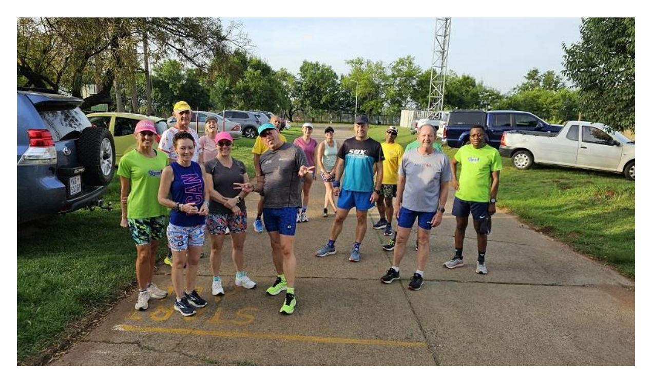
Time trials last week