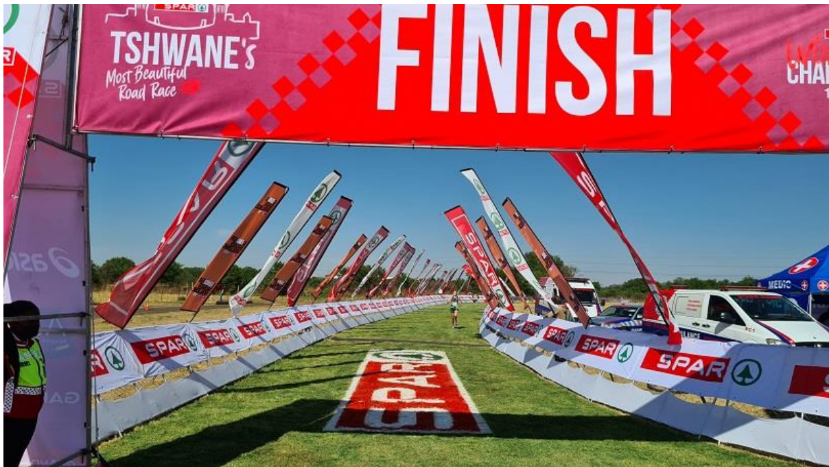
Amazing what grass painting can do

On Friday our race venue was transformed into a proper race for the first time since Covid hit us. Hopefully we will see more of it in 2022.