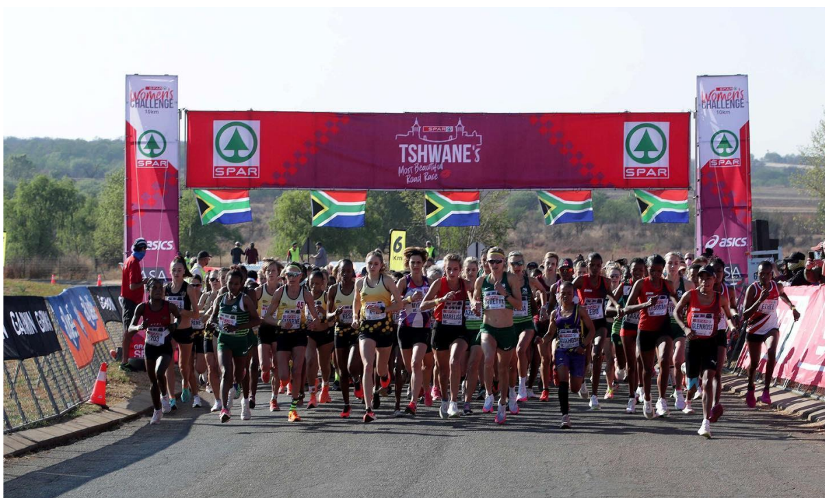
The start of the Spar Women Grand Prix