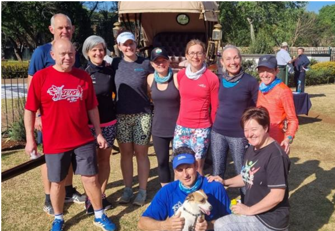
The Irene Catch Up Heritage run