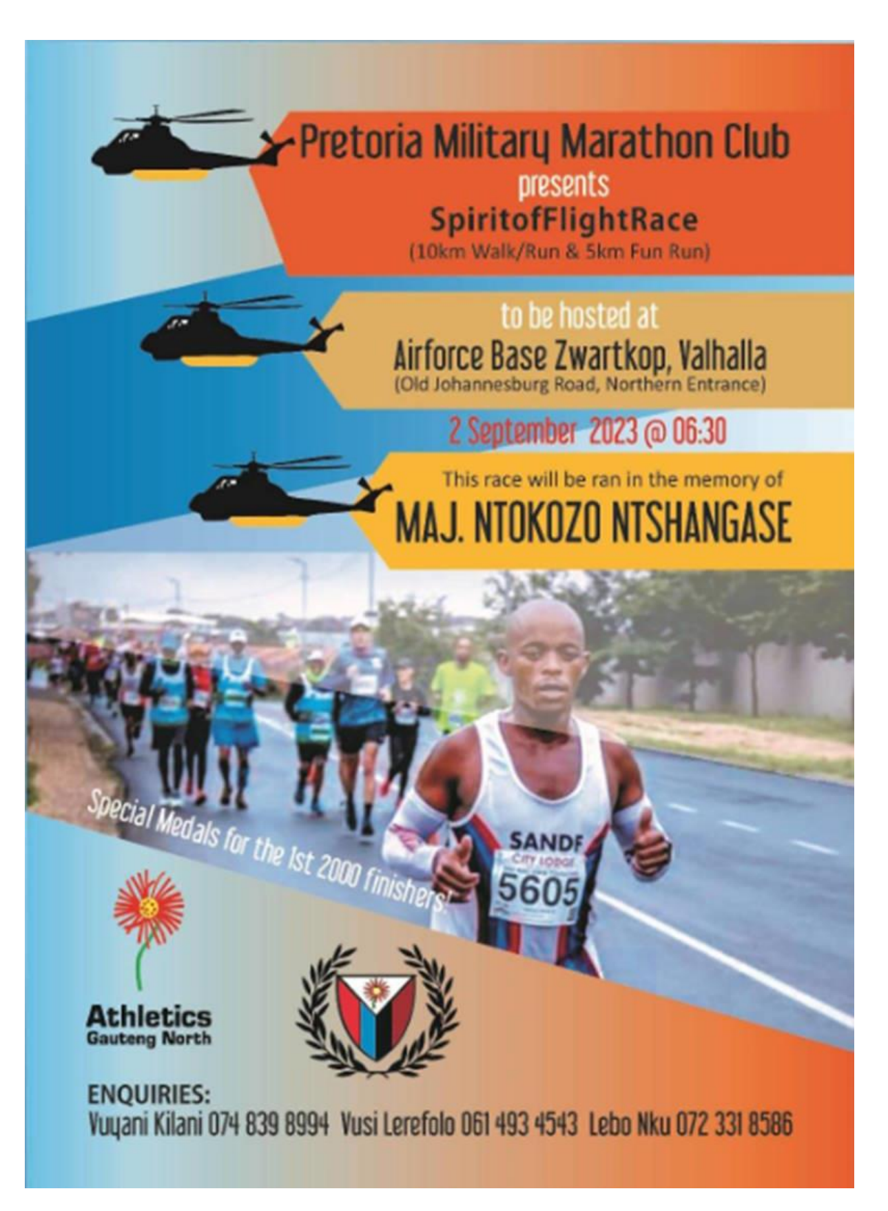
This race will serve as our club 10 km championships