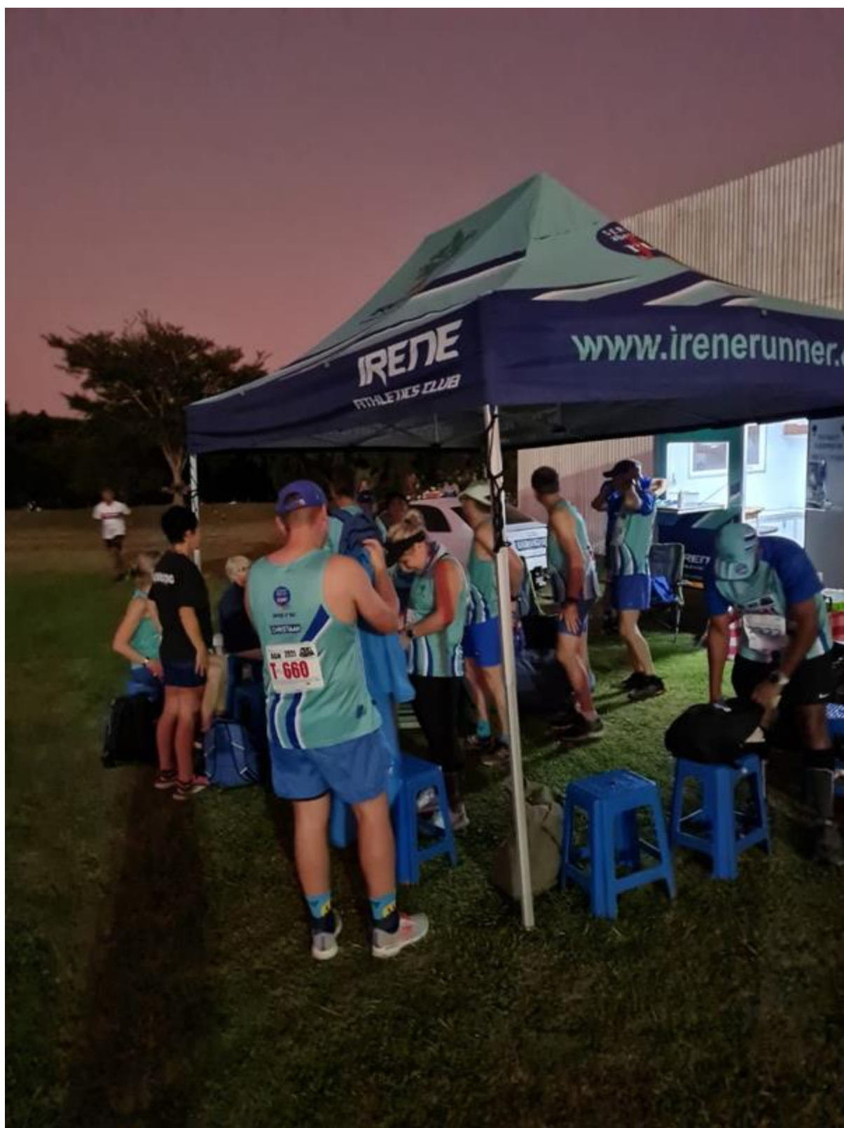
For the first time in two years our Cara-Fun was in operation again