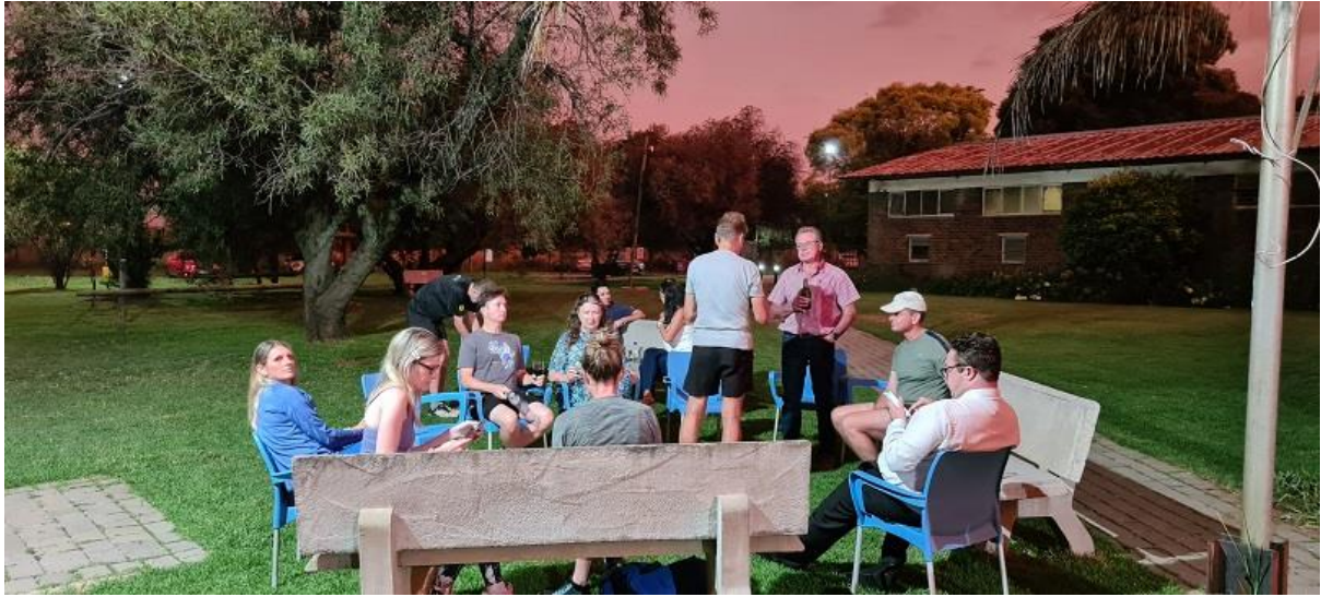
A lovely scene at the time trials