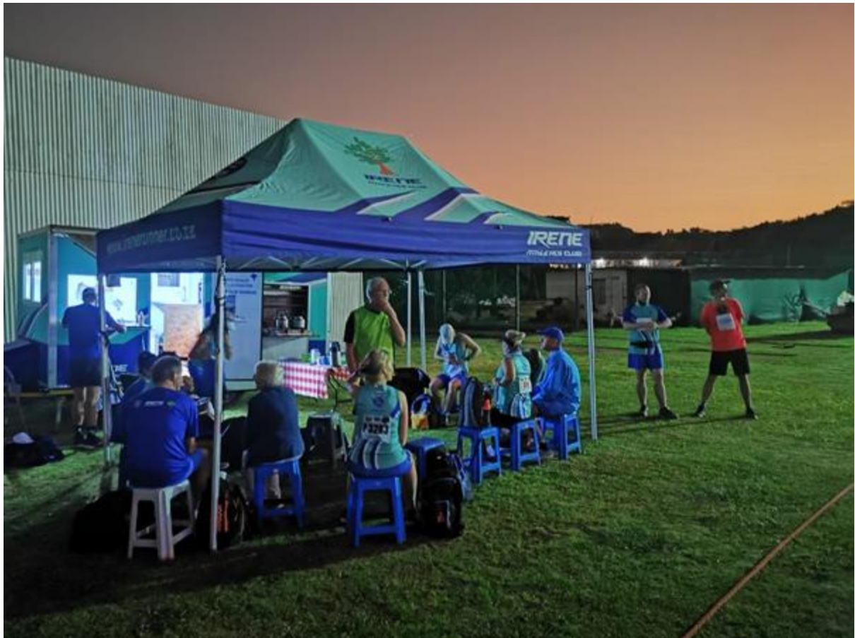
Sunrise at the Phobians race