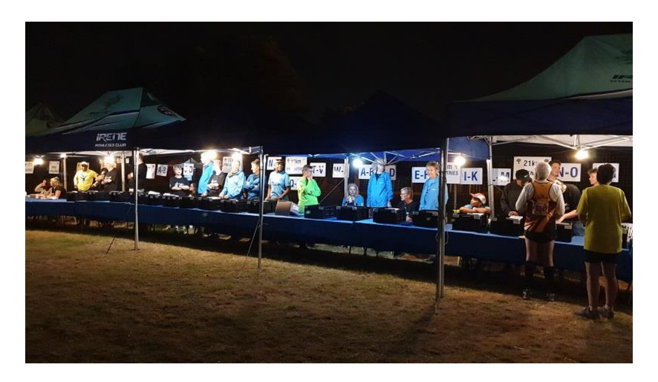
The registration tables on Saturday morning