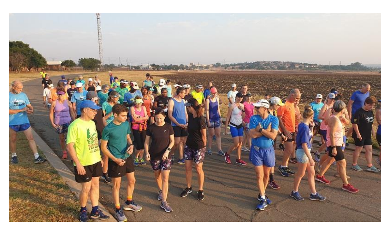
The start of the helpers run on Sunday morning