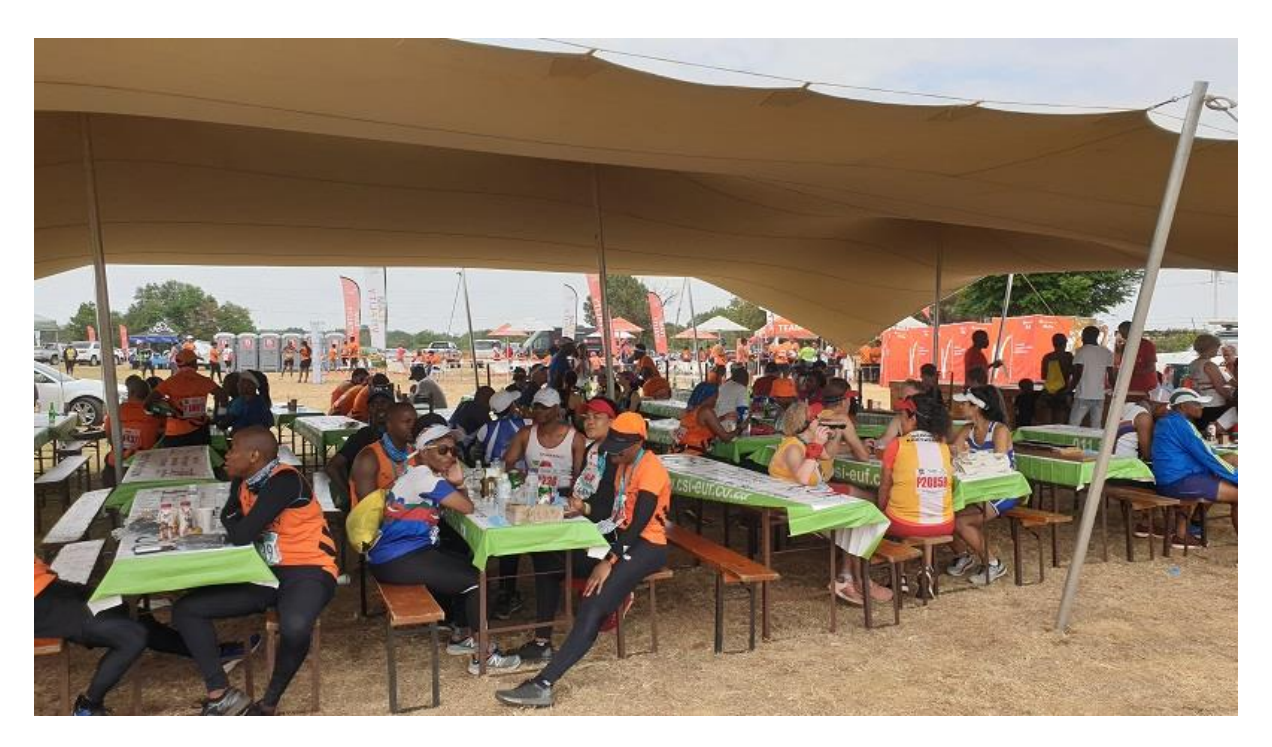
Runners relaxing after the race