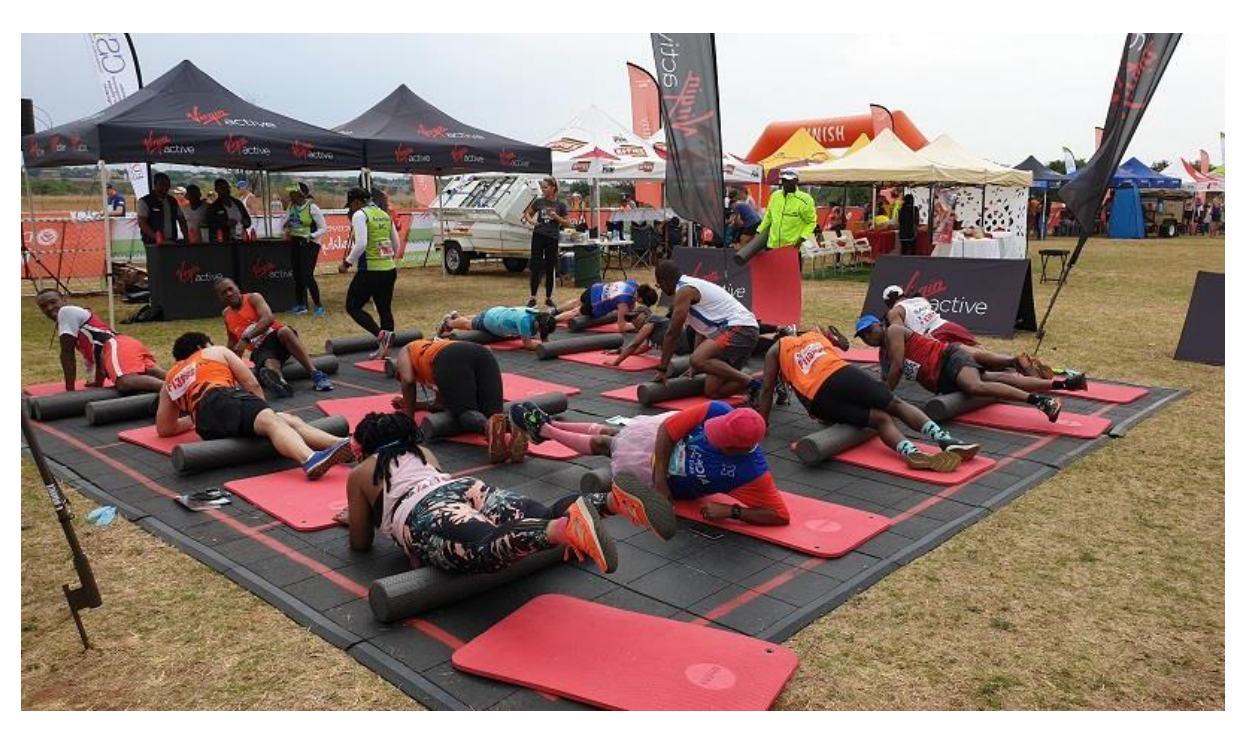
Virgin Active was responsible for the cooldown of the athletes