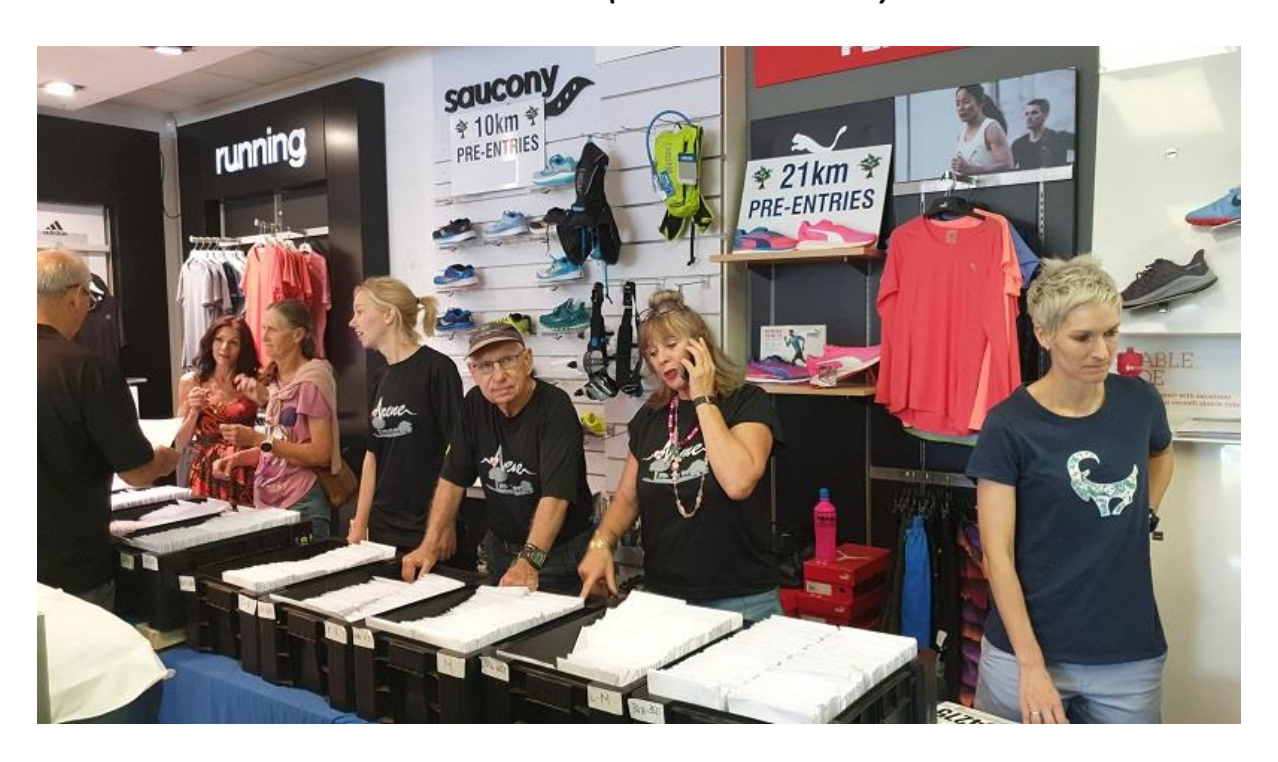
Irene members handing out the pre-entries at the Sweatshop Southdowns on Friday