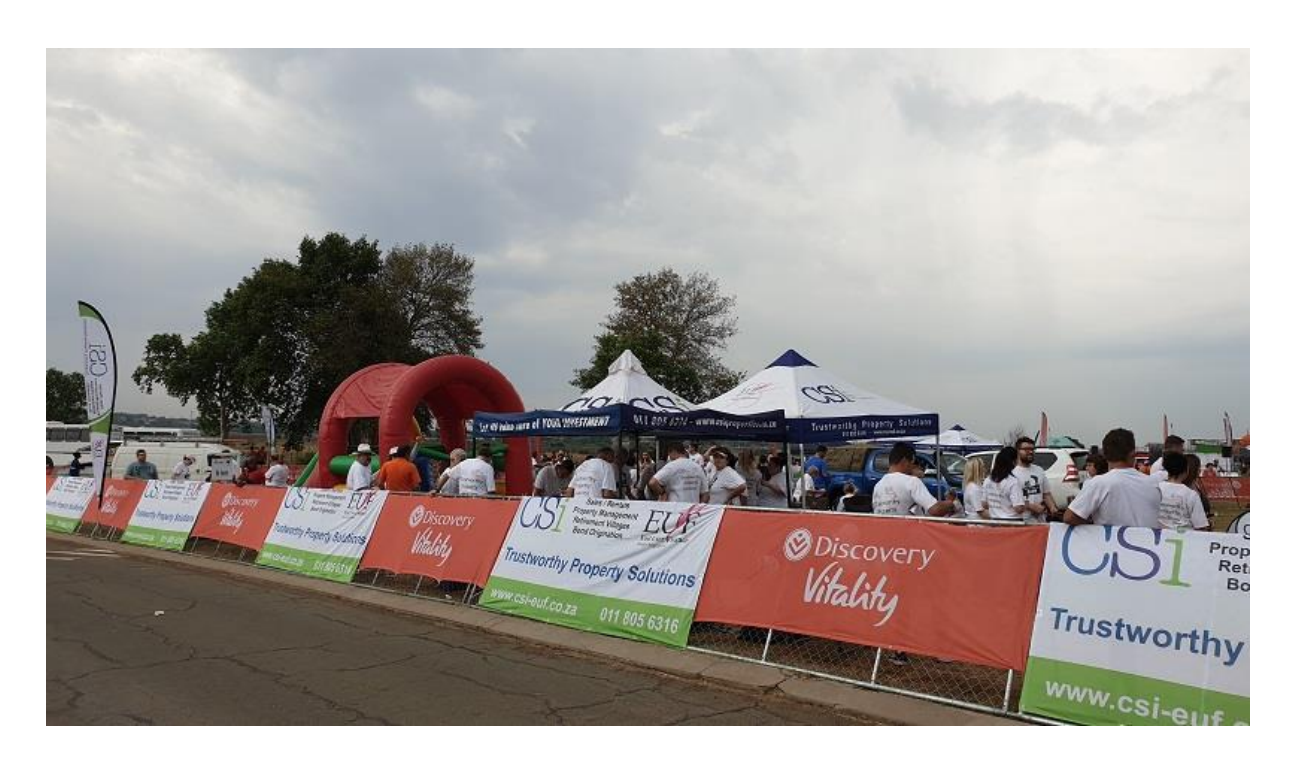
The venue was very colorful with all the branding