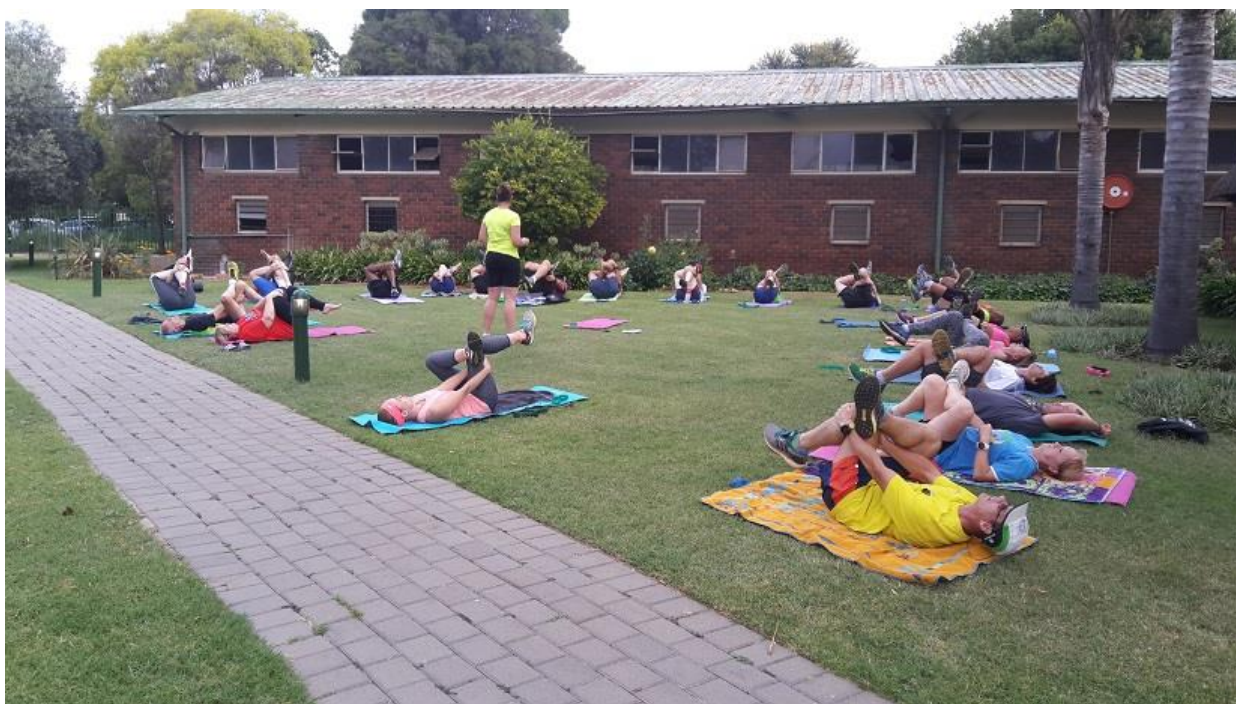
The place to be on a Monday at 17:30. The strength exercise sessions are going from strength to strength